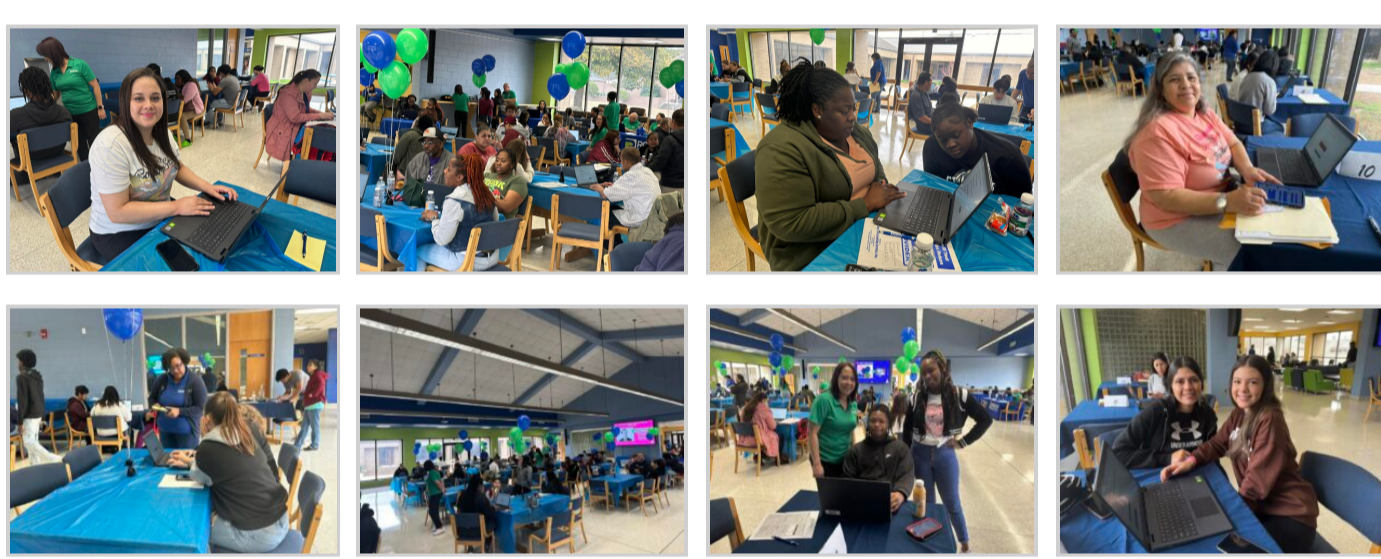
Photos above shows FAFSA Day 2024 in full-swing at Robeson Community College as more than 100 people came out seeking assistance with financial aid. RCC had the second-highest ranking attendance across the state with 108 students checking in during the event.