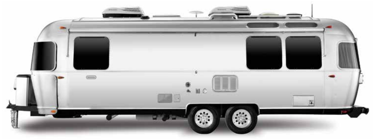
(Above) The latest Airstream trailer, the 2018 Globetrotter / (Opposite page) Airstream Sport / www.airstream.com

Today, Airstream manufactures six different travel trailers ries, International Signature Series, Flying Cloud, Basecamp,