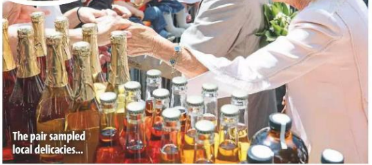
The pair sampled local delicacies...