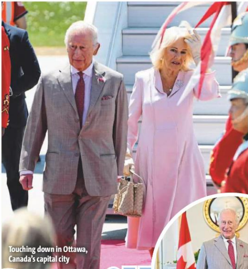
Touching down in Ottawa, Canada's capital city