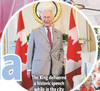
The King delivered a historic speech while in the city

diplomatic and clear, a show of support for Canada's sovereignty. A source told the BBC, 'The King has long experience and great skill in walking that diplomatic tightrope. He's held in high regard around the globe and across the political spectrum, with good relations with world leaders, who understand his unique position.' According to Buckingham Palace, the royal couple hope their two-day visit to the Commonwealth nation will be 'impactful' – and indeed, the impact was felt by locals. One individual told the BBC, 'Canada feels threatened and scared,' as another added, 'It means a great deal to have the King standing side by side with Canadians.'