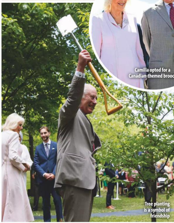
Tree planting is a symbol of friendship

Huge crowds come out to celebrate the royal visit