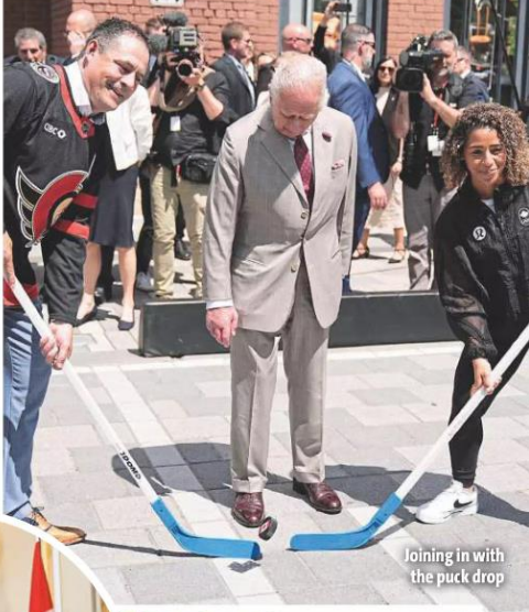
Joining in with the puck drop