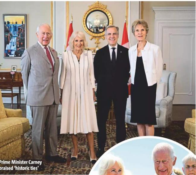
Prime Minister Carney praised 'historic ties'