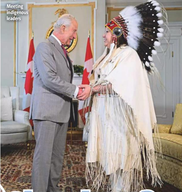
Meeting indigenous leaders