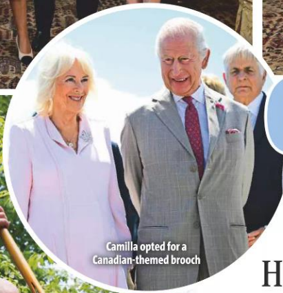
Camilla opted for a Canadian-themed brooch