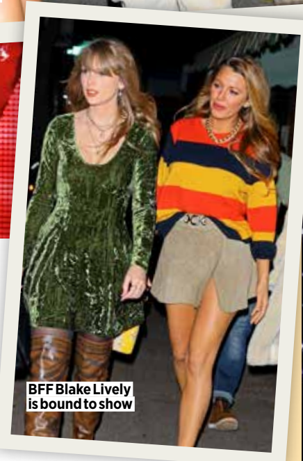
BFF Blake Lively is bound to show