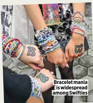
Bracelet mania is widespread among Swifties

Whether you're watching from a stadium or the comfort of your home, The Eras Tour is bringing Taylor mania right to the shores of good ol' Blighty – and something tells us this frenzy won't be ending anytime soon. ■