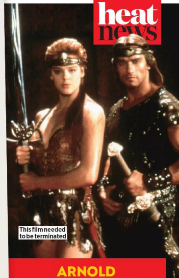
This film needed to be terminated

Opening up about 1985's Red Sonja , Arnold, 77, shared, 'It's the worst film I ever made. When my kids get out of line, they're sent to their rooms and forced to watch Red Sonja 10 times. I never had too much trouble with them.' Talk about a parenting hack!