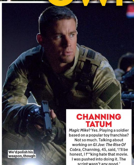
We'd polish his weapon, though

Magic Mike ? Yes. Playing a soldier based on a popular toy franchise? Not so much. Talking about working on GI Joe: The Rise Of Cobra , Channing, 45, said, 'I'll be honest, I f**king hate that movie. I was pushed into doing it. The script wasn't any good.'