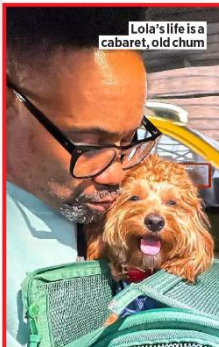
Lola's life is a cabaret, old chum

An avid animal lover, it's no surprise that Miley, 32, wasn't going down without a fight when it came to her divorce from Liam, 35. When the couple split in 2019 after seven months of marriage, they were described as having a 'miniature zoo' – made up of seven dogs, three cats, two horses, two miniature horses, and an adopted pig. Miley walked away with full custody of their 15 pets, with insiders saying Liam chose not to challenge it.