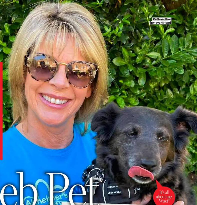
Ruth and her fur-ever friend