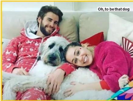
Oh, to be that dog

Broadcast for millions to watch, the fallout from Johnny and Amber's 15-month marriage was mammoth – with no one feeling it more than their two Yorkshire Terriers, Pistol and Boo. During the couple's 2016 divorce, tensions rose over the pint-sized pups. While Amber, 38, wanted to keep Pistol – who was given to her by an ex-girlfriend – Johnny, 61, wanted to avoid splitting them up. Eventually, Amber was given custody of the two dogs.