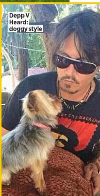
Depp V Heard: doggy style