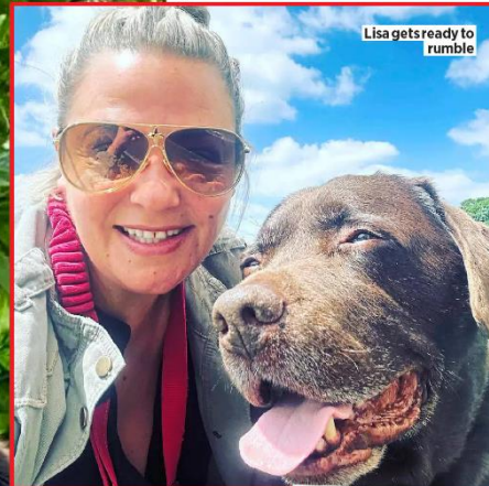
Lisa gets ready to rumble