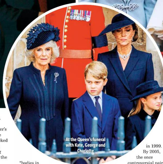
At the Queen's funeral with Kate, George and Charlotte