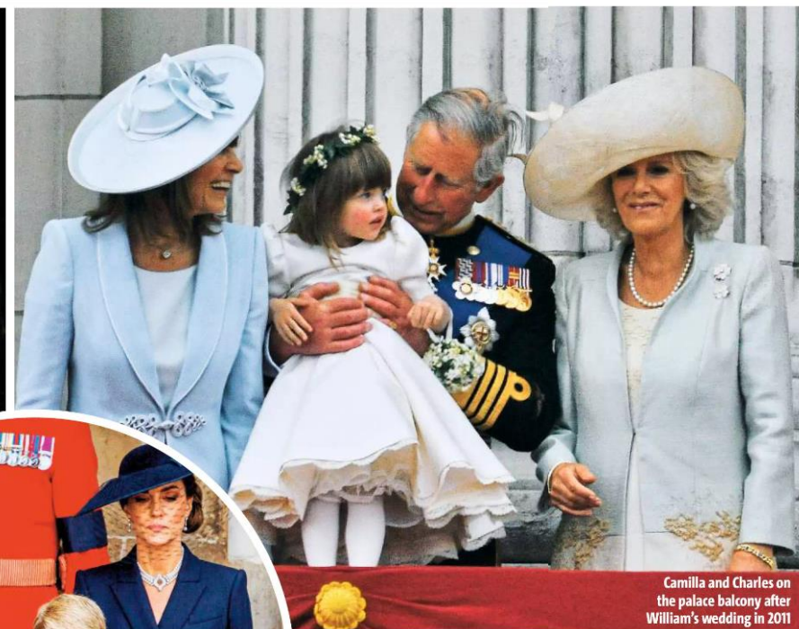
Camilla and Charles on the palace balcony after William's wedding in 2011