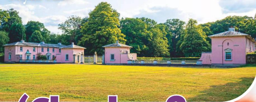
Royal Lodge, Windsor