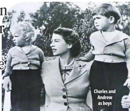
Charles and Andrew as boys

King Charles’s plan to evict his brother Andrew from his Royal Lodge Home could tear the family apart