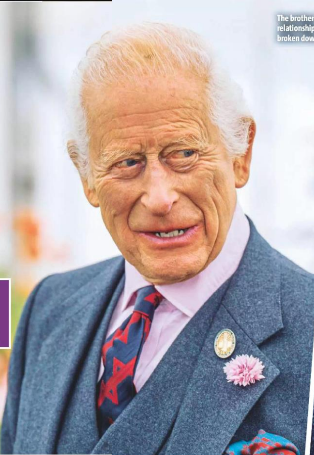
The brothers’ relationship has broken down

Despite the King’s wishes for his younger brother to relocate to Prince Harry and Meghan Markle’s former Frogmore Cottage home, Andrew is refusing to move out of his Royal Lodge mansion, which is said to be testing the monarch’s patience. King Charles is said to be at the end of his tether and has made it clear there are now only ‘two possible options’ for Andrew – to pay his own way or to