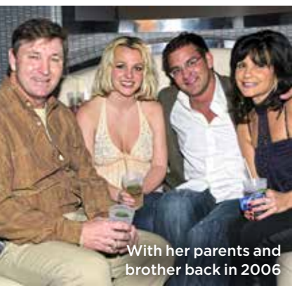
With her parents and brother back in 2006