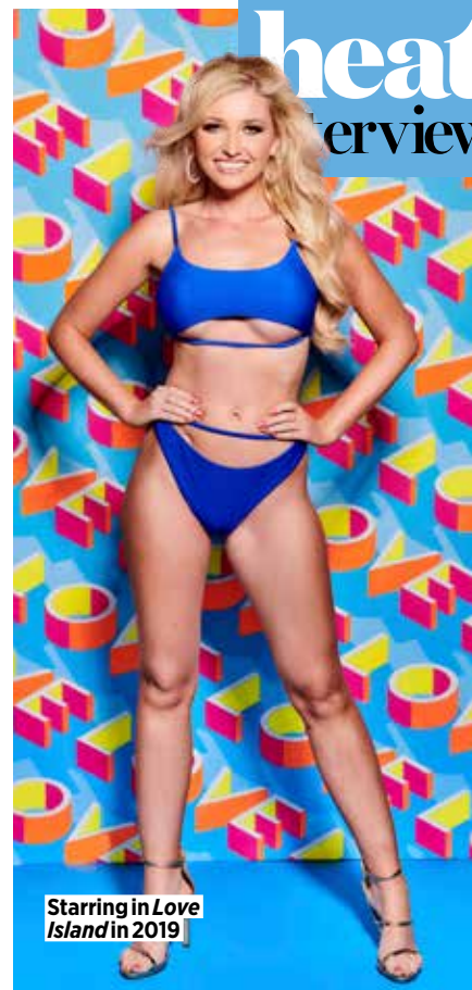
Starring in Love Island in 2019