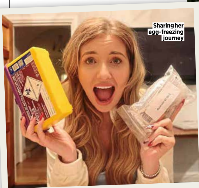
Sharing her egg-freezing journey