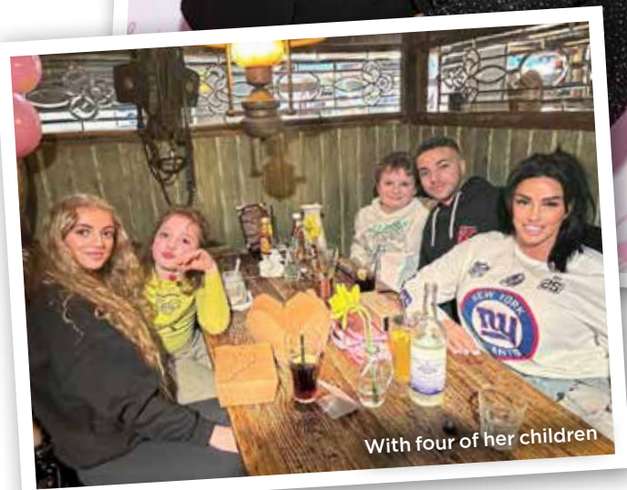
With four of her children