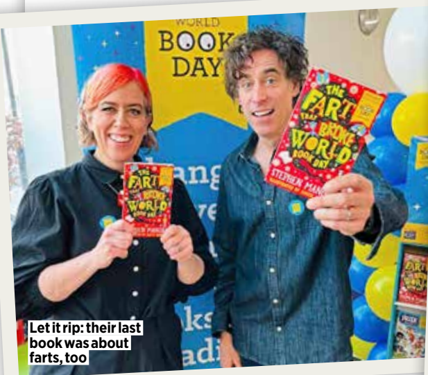
Let it rip: their last book was about farts, too