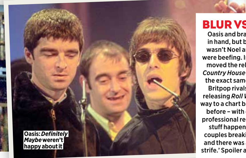
Oasis: Definitely Maybe weren't happy about it