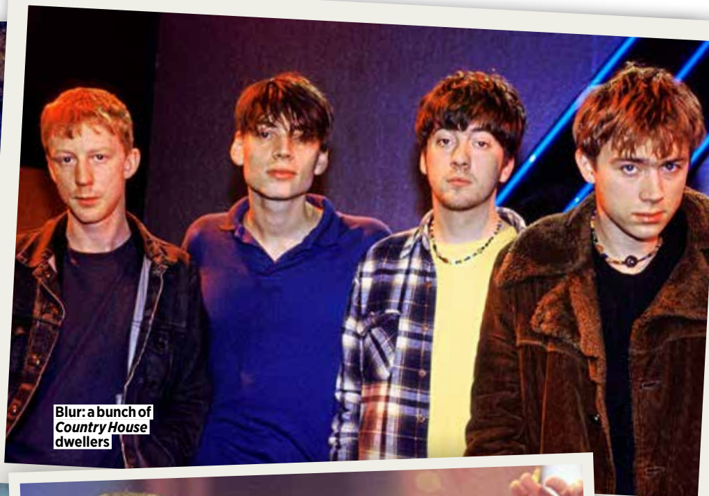
Blur: a bunch of Country House dwellers

In the midst of the wild '90s, 20-year-old Drew Barrymore appeared on The Late Show with David Letterman, donning sweet daisies in her hair. The Never Been Kissed star proceeded to climb up on the talk show host's desk and flash her boobs – in front of a live studio audience. Since reflecting on the 'weird and spontaneous moment', Drew said, 'If there's one thing I've learned, [it's that] there is a line.'