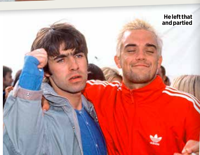
He left that and partied

A world without Clueless ? Ugh, as if! A cult classic, the movie hit screens in 1995, securing Alicia Silverstone, then 18, as the ultimate 'It' girl. With pin-straight hair and a penchant for tartan, the movie increased the use of the word 'whatever' and gave girls everywhere a new kind of role model to aspire to. Three decades later, it's still every bit as influential, with a brand-new Clueless musical hitting the West End.