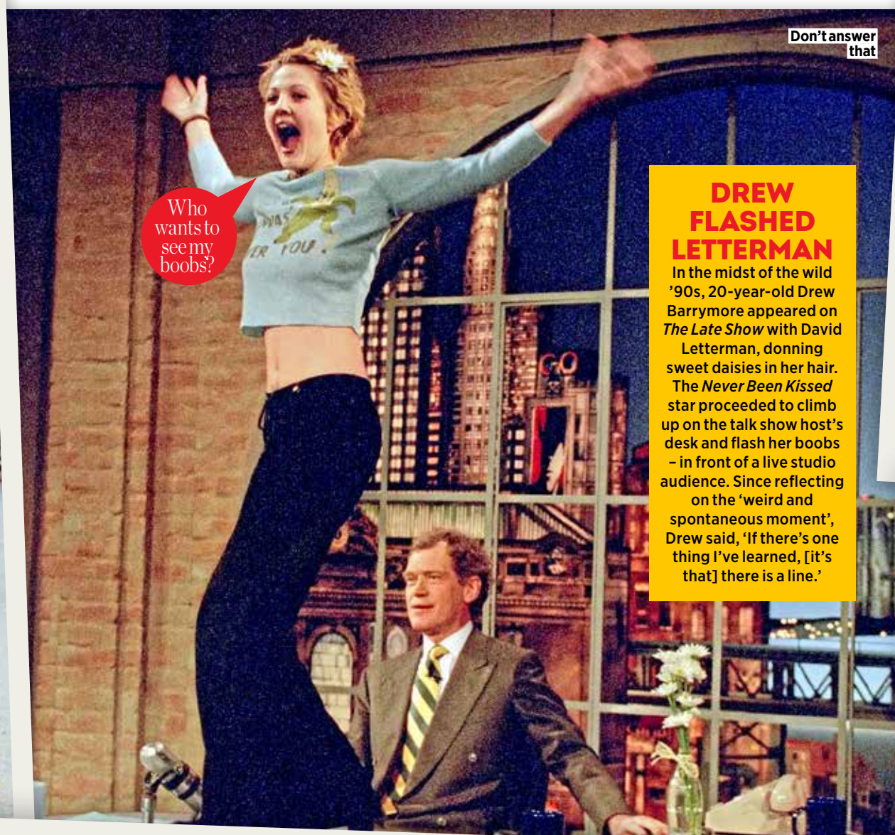
Don't answer that

In 1995, Take That crooned, ' I guess now it's time for me to give up... ' For Robbie, it was advice that rung true. Hearts broke across the globe when the 21 year old announced he was leaving the band to pursue his own solo career. The writing had been on the wall for a while – just weeks before he quit, a wasted-looking Robbie was spotted partying with Oasis at Glastonbury, later describing the moment as the catalyst for his 'new life'.