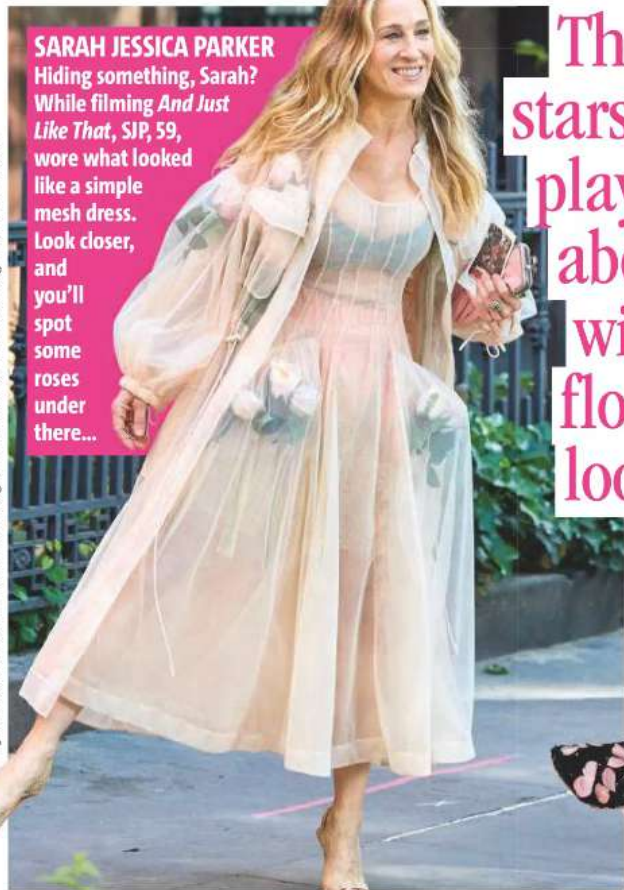
SARAH JESSICA PARKER Hiding something, Sarah? While filming And Just Like That , SJP, 59, wore what looked like a simple mesh dress. Look closer, and you'll spot some roses under there...

These stars love playing about with floral looks