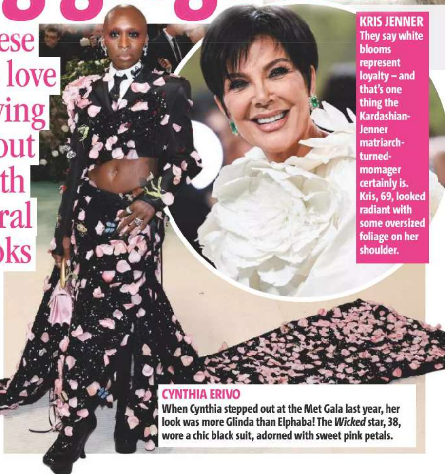
CYNTHIA ERIVO When Cynthia stepped out at the Met Gala last year, her look was more Glinda than Elphaba! The Wicked star, 38, wore a chic black suit, adorned with sweet pink petals.

These stars love playing about with floral looks