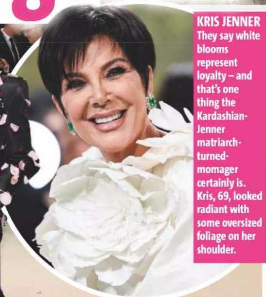
KRIS JENNER They say white blooms represent loyalty – and that's one thing the Kardashian-Jenner matriarch-turned-momager certainly is. Kris, 69, looked radiant with some oversized foliage on her shoulder.