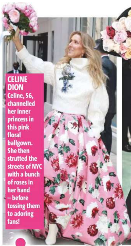
CELINE DION Celine, 56, channelled her inner princess in this pink floral ballgown. She then strutted the streets of NYC with a bunch of roses in her hand – before tossing them to adoring fans!