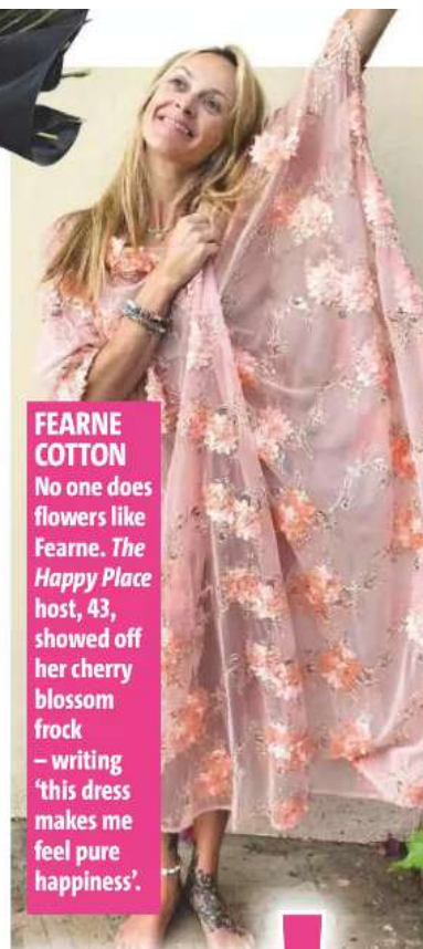
FEARNE COTTON No one does flowers like Fearne. The Happy Place host, 43, showed off her cherry blossom frock – writing 'this dress makes me feel pure happiness'.