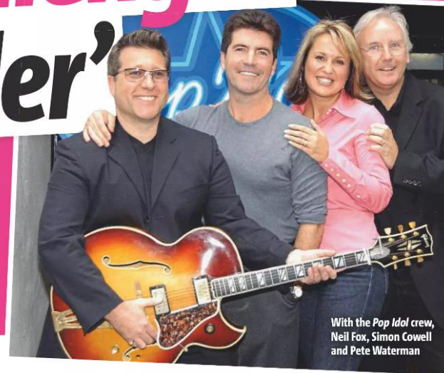
With the Pop Idol crew, Neil Fox, Simon Cowell and Pete Waterman

Nicki Chapman has ticked off a lot of boxes in her career, but she's not finished yet