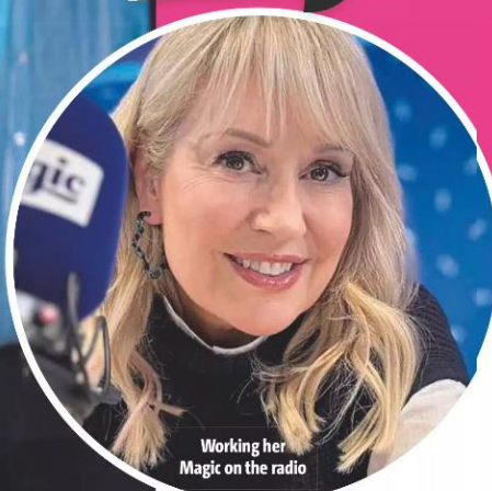
Working her Magic on the radio

Nicki Chapman boasts decades of experience in the media industry. Not only did she work as a respected PR for stars including the Spice Girls, Take That, Amy Winehouse and Kylie Minogue, but she became a household name in the early noughties with TV judging roles on Popstars and Pop Idol , before going on to present shows such as Escape To The Country and Wanted Down Under .