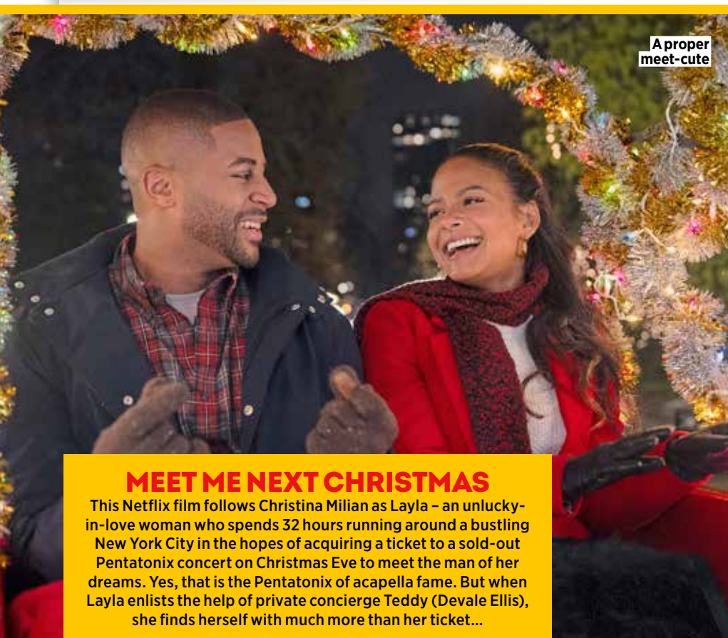
A proper meet-cute