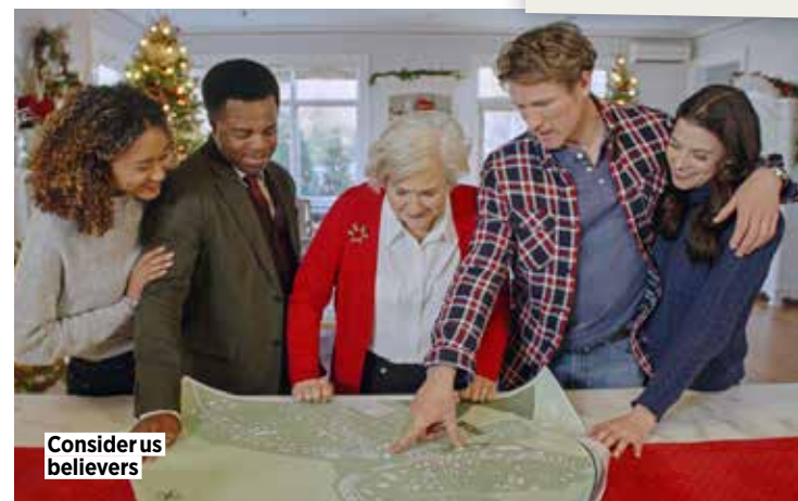
Consider us believers

What's Christmas without bickering? New retiree Barb (Beth Broderick) decides to fill her time by joining a holiday committee, only to find herself clashing with long-standing member Kath (Caroline Rhea). While most would be able to move on, it doesn't prove quite so easy for these meddling mothers once they realise their kids are dating. For an added nostalgic bonus, you may recognise the two leads as the aunts from classic teen sitcom Sabrina The Teenage Witch . Available on Hallmark.