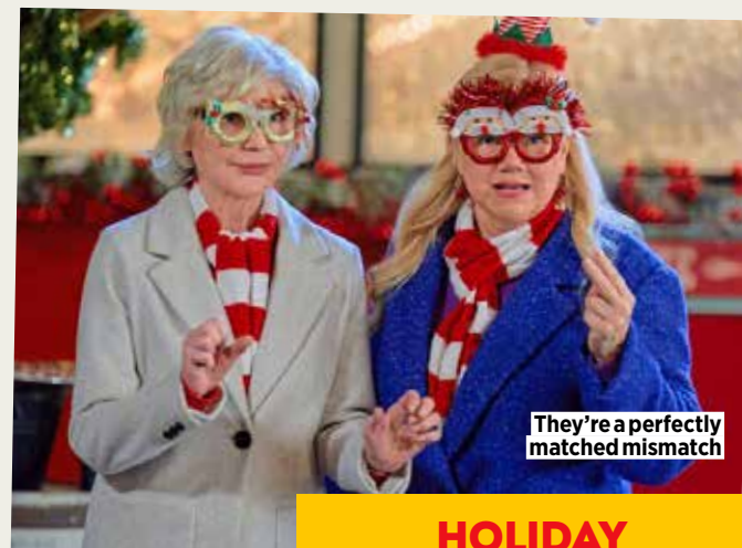
They're a perfectly matched mismatch

Starring Meghan Ory and John Rearden, this is the kind of holiday romcom you'll watch again and again. With no other plans for Christmas, Bea reluctantly joins her best pal Emilia on a trip to Christmasland. Initially sceptical of the merriment, Bea finds her frosty exterior melting after meeting the ever-so-charming Ethan – leaving her questioning what's real, and what's part of the Christmasland experience. Available now with Hallmark TV, it's a love bonanza.