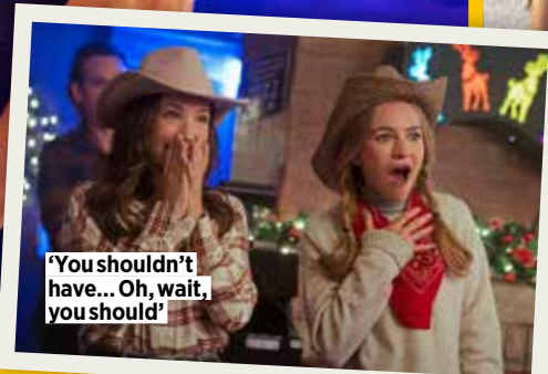
'You shouldn't have... Oh, wait, you should'