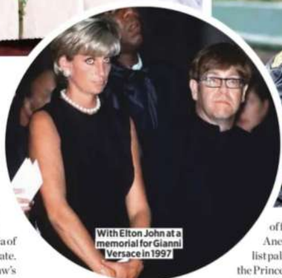
With Elton John at a memorial for Gianni Versace in 1997

While the break from royal precedent caused quite a stir back in 1981, Diana had no idea of the ripple effect she would create. Following in her mother-in-law's footsteps, Kate Middleton left “obey” out of her vows when she married Prince William 30 years later, with Meghan Markle and Princess Eugenie following suit.