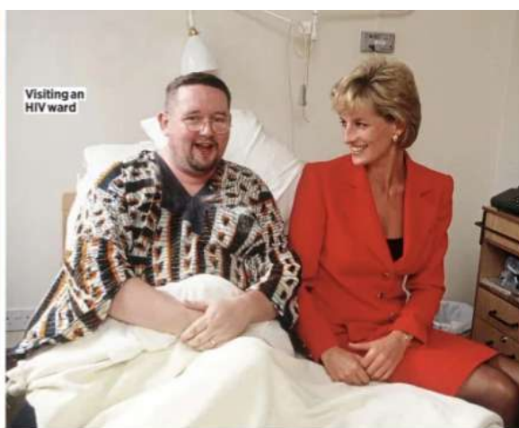
Visiting an HIV ward