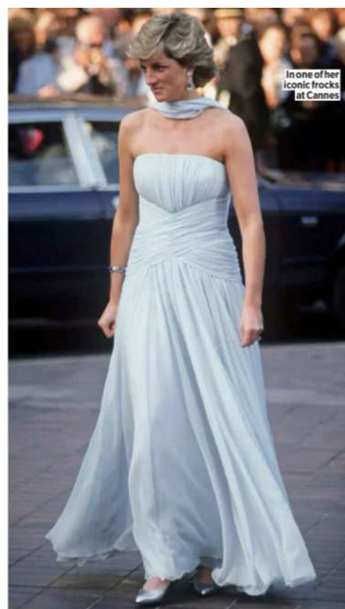
In one of her iconic frocks at Cannes