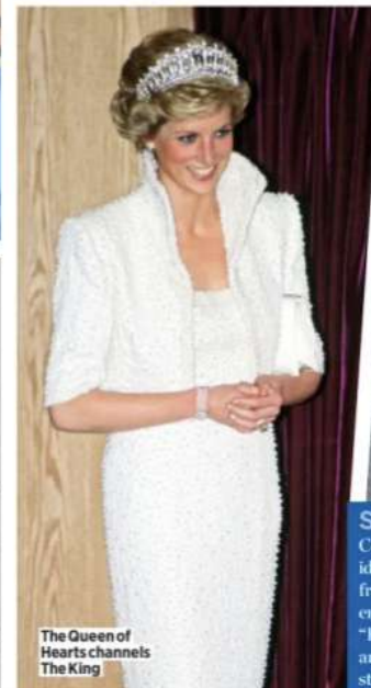
The Queen of Hearts channels The King

All eyes were on John Travolta and Princess Diana in November 1985, when they danced together at the White House during a gala hosted by then-President Ronald Reagan. British royalty and a Hollywood heart throb made for a mesmerising duo and John described the moment as "special and magical".