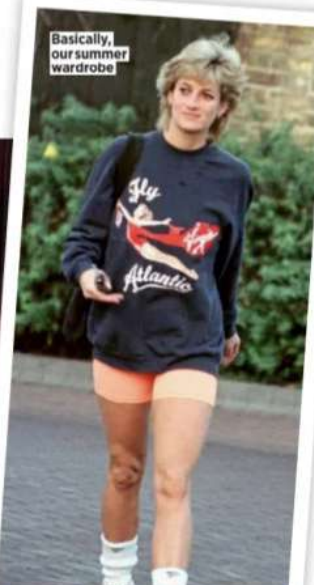
Basically, our summer wardrobe