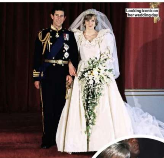
Looking iconic on her wedding day