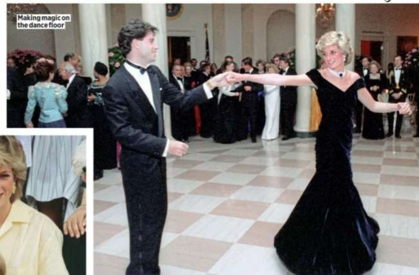
Making magic on the dance floor