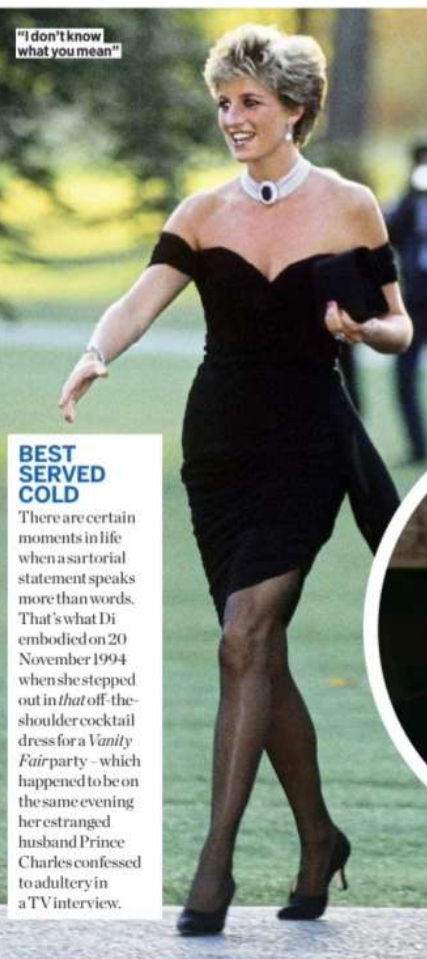
"I don't know what you mean"

She was a trailblazer, a fashionista, a feminist, and an icon to many