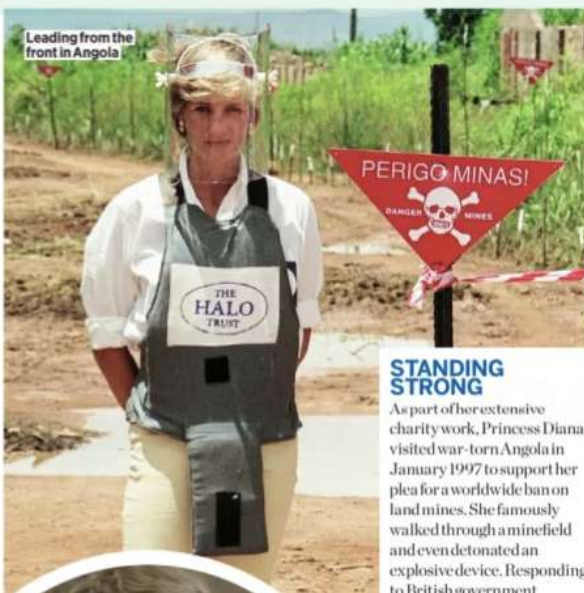
Leading from the front in Angola

There are certain moments in life when a sartorial statement speaks more than words. That's what Di embodied on 20 November 1994 when she stepped out in that off-the-shoulder cocktail dress for a Vanity Fair party - which happened to be on the same evening her estranged husband Prince Charles confessed to adultery in a TV interview.