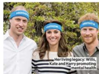
Her living legacy: Wills, Kate and Harry promoting mental health

Speaking about Diana, Harry said, “We will do everything we can to make sure that she's never forgotten and carry on all of the special gifts, as such, that she portrayed while she was alive,” later adding, “I honour my mother in everything I do. I am my mother's son.” ■