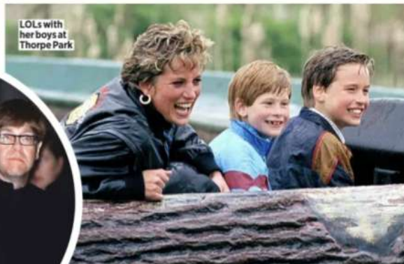
LOLs with her boys at Thorpe Park