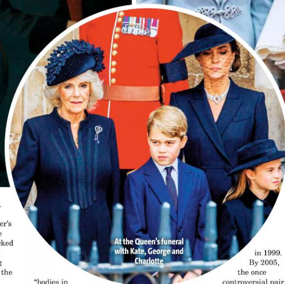
At the Queen's funeral with Kate, George and Charlotte