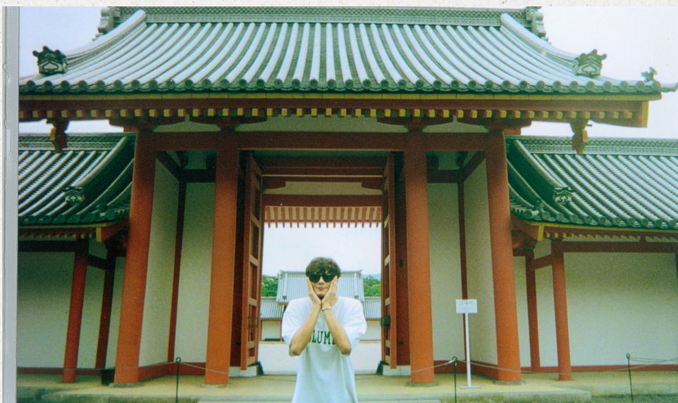
MY WONDERFUL BOYFRIEND IN JAPAN LAST SUMMER

MY DAD'S SIDE OF THE FAMILY LIVES HERE IN THE UNITED STATES, WHILE MY MOM'S SIDE OF THE FAMILY LIVES IN SOUTH KOREA. MY MOM RECENTLY MOVED TO SOUTH KOREA IN 2019, AND SINCE THEN, I'VE BEEN VISITING EVERY SUMMER.