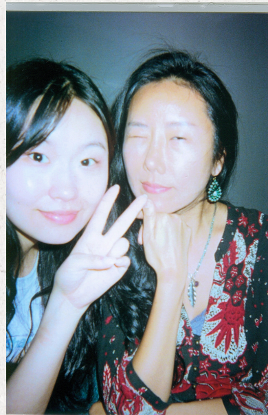
MOM AND I LAST SUMMER