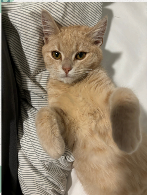
WHISKEY BEING WHISKEY