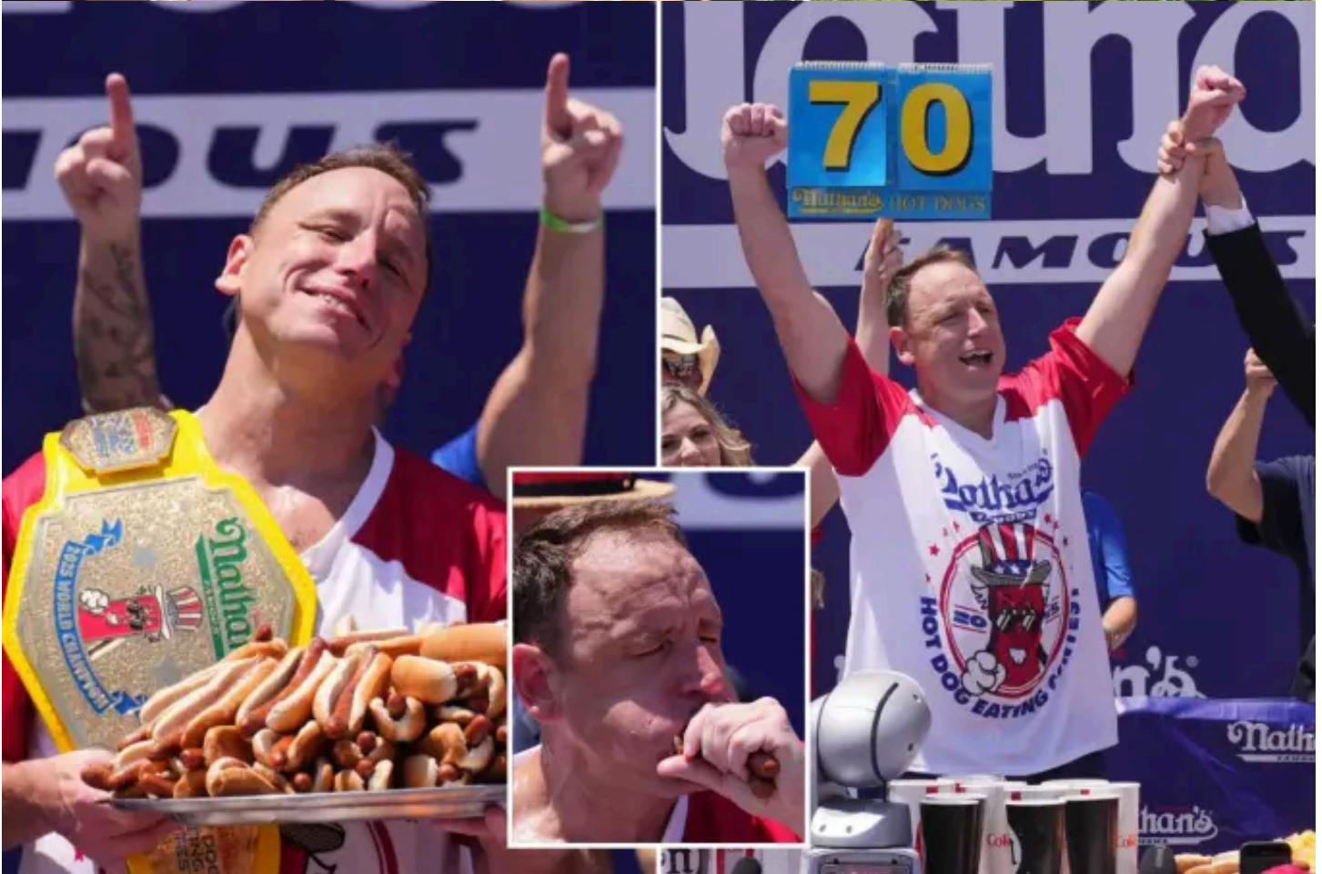
Wiener king Joey Chestnut reclaims title at Nathan's Hot Dog Eating Contest