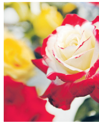
A hybrid tea rose was one of many on display at the 11th annual Celebration of Roses.

The Celebration of Roses, the 11th annual event organized by the Rose Club, took place Wednesday