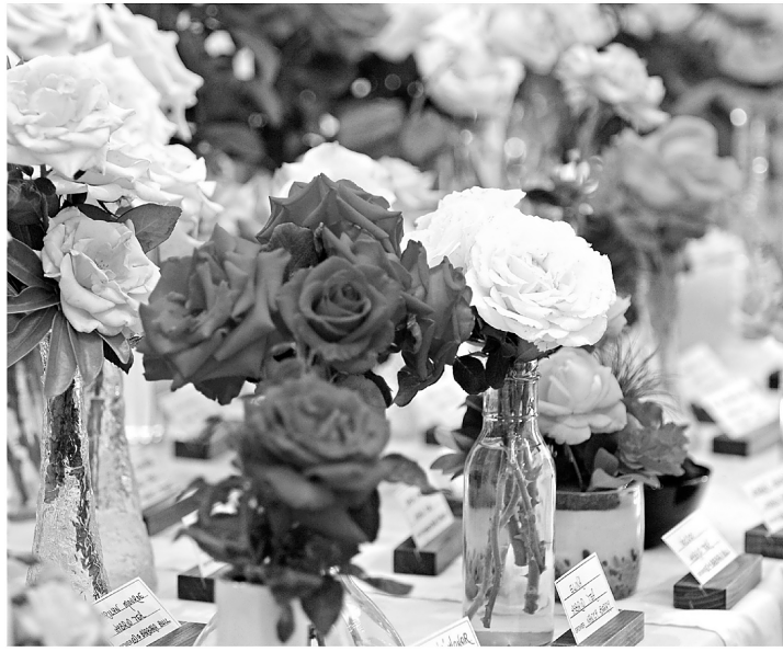
Roses from eight classifications were on display at the 11th annual Celebration of Roses.

"The idea is for the roses to continue to bring happiness to people who, for physical reasons, are not able to be here," she said.