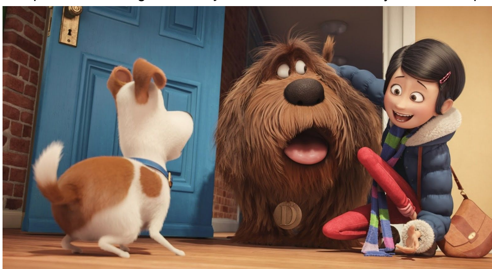
A girls and her dogs!

And a few that mostly show a couple with their dog like Marley and Me or a whole family's relationship with their dog like Beethoven .