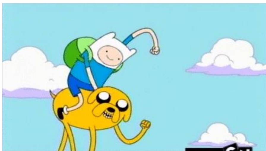
Jake the Dog and Finn the Human

As both Women's Equality Day and National Dog Day on August 26 one has to wince slightly at the juxtaposition of a major social rights movement with the honor bestowed on a most beloved pet species. In considering the pop culture connectedness of both days, it's nice to know there are a number of movies and television shows one can recommend to those seeking a little female empowerment and equity, and plenty of films showcasing the relationship between human and dog as well.