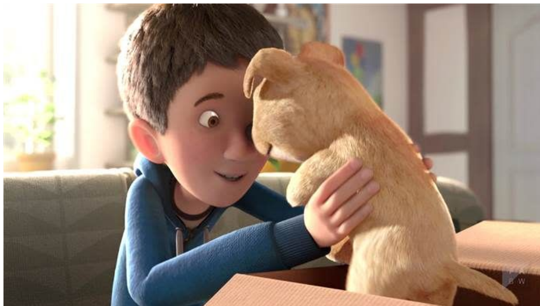
"The Present" is a great short film, but again with a boy and dog?

Of course, there are the age-old tropes of dogs being man's best friend and cats being the ideal feminine companion, but surely we've thrown off such ridiculous concepts. Most animal-related films are family and children films, so how could we be missing representation of a gender in such films aimed intended for such formative years? If equality includes representation in the media, especially in engendering normalcy, surely a little girl should find her love for her pet represented on screen and not be made to feel that she's abnormal for being a "dog person.'