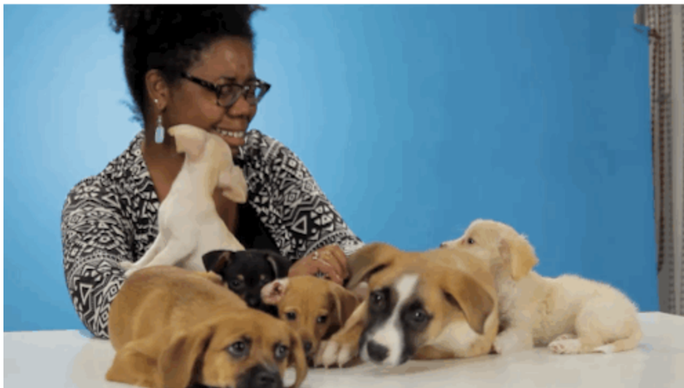
Puppies are a girl's best friend.

Let's think on this suggestion a bit and just be glad I didn't decide to get this critical on Go Topless Day. Which is Sunday, August 28, by the way.