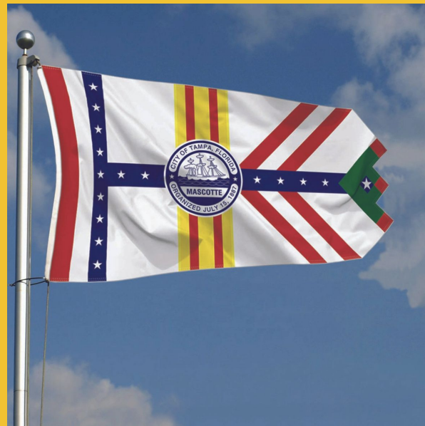
Flag of Tampa, FL

The flag of Tampa was accepted in July of 1930 and was designed with Florida's multi-national heritage in mind. The flag designer was F. Grant Whitney.