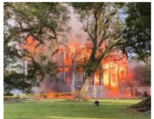
Nottoway Plantation, White Castle, Louisiana

Multiple airports across the country have reported random outages lasting up to 90 seconds. A haunted doll is hanging out in Louisiana. Also in Louisiana, the South's largest antebellum plantation burned to the ground Thursday and ten New Orleans prisoners escaped Friday morning. At present, seven are still on the loose. Annabelle, was this you?