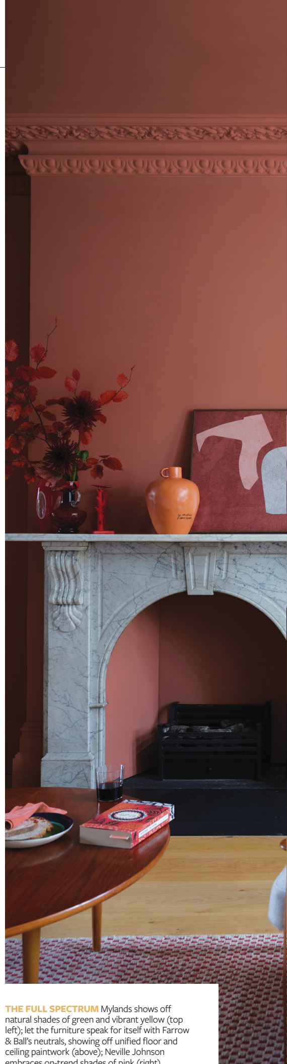
THE FULL SPECTRUM Mylands shows off natural shades of green and vibrant yellow (top left); let the furniture speak for itself with Farrow & Ball's neutrals, showing off unified floor and ceiling paintwork (above); Neville Johnson embraces on-trend shades of pink (right)