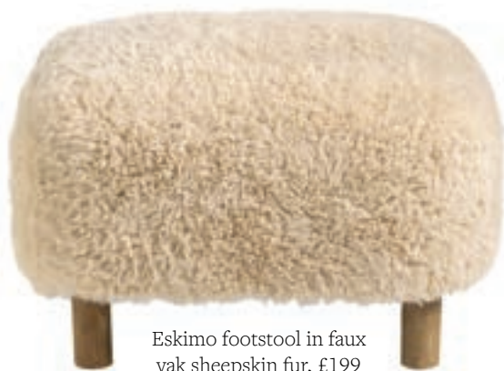
Eskimo footstool in faux yak sheepskin fur, £199 wheresaintsgo.co.uk