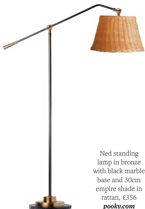
Ned standing lamp in bronze with black marble base and 30cm empire shade in rattan, £356 pooky.com