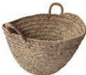
Berber storage log basket, £34 basketbasket.co.uk