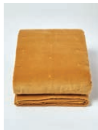
Velvet quilted throw in mustard, £29.99 homescapesonline.com