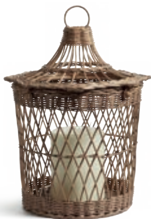
Rodin rattan lantern, £90 oka.com