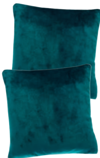
Cashmere touch fleece cushion, from £15 waltonshop.co.uk