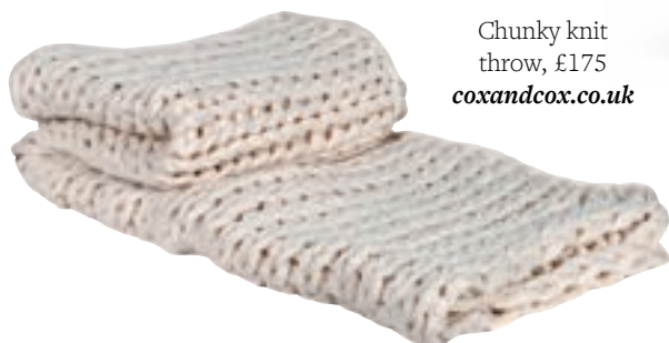
Chunky knit throw, £175 coxandcox.co.uk