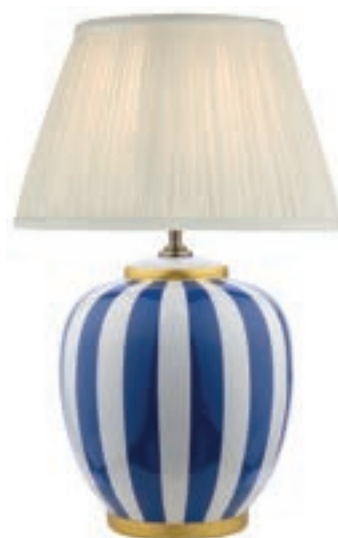
Circus ceramic table lamp, £199 darlighting.co.uk