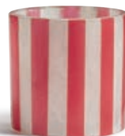
Large Cormack candle holder, £25 oka.com