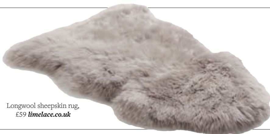
Longwool sheepskin rug, £59 limelace.co.uk