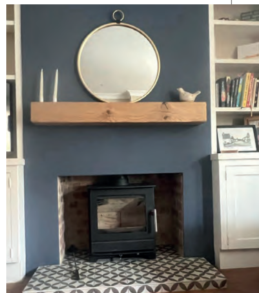
HOME FIRES MCZ (left) and Cambridge Stove Installations (above) recommend wood-burning stoves as a long-term cost-saving option for your heating bills

Goddards Stoves, based in Saffron Walden, is a one-stop shop where you can find fireplace surrounds and mantelpieces, plus a range of stoves to suit every home. This could be a compact log-burner for a cottage or large multi-fuel stove for a barn conversion. ♦♦