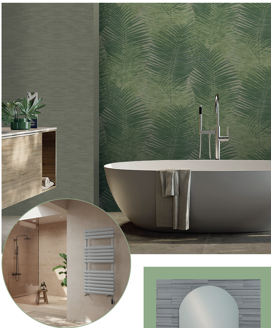
ZEN ZONE Beautiful Walls (top) can add character and creativity to any room of the house, while UK Radiators (above) offers stylish additions, bringing warmth both figurative and literal