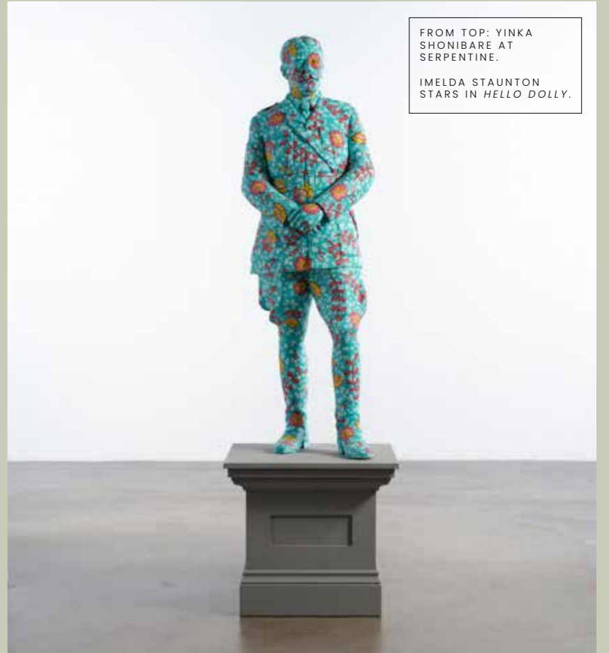
FROM TOP: YINKA SHONIBARE AT SERPENTINE. IMELDA STAUNTON STARS IN HELLO DOLLY .

Set to be the latest West End blockbuster is the new Hello, Dolly! musical, featuring four-time Olivier Award winner, Imelda Staunton. The brand-new production at the London Palladium is rumoured to have a limited run until 14 September, so grab your tickets while you can. It reunites Imelda with director Dominic Cooke, following their critically acclaimed production of Stephen Sondheim's Follies at the National Theatre. HELLODOLLYLDN.COM