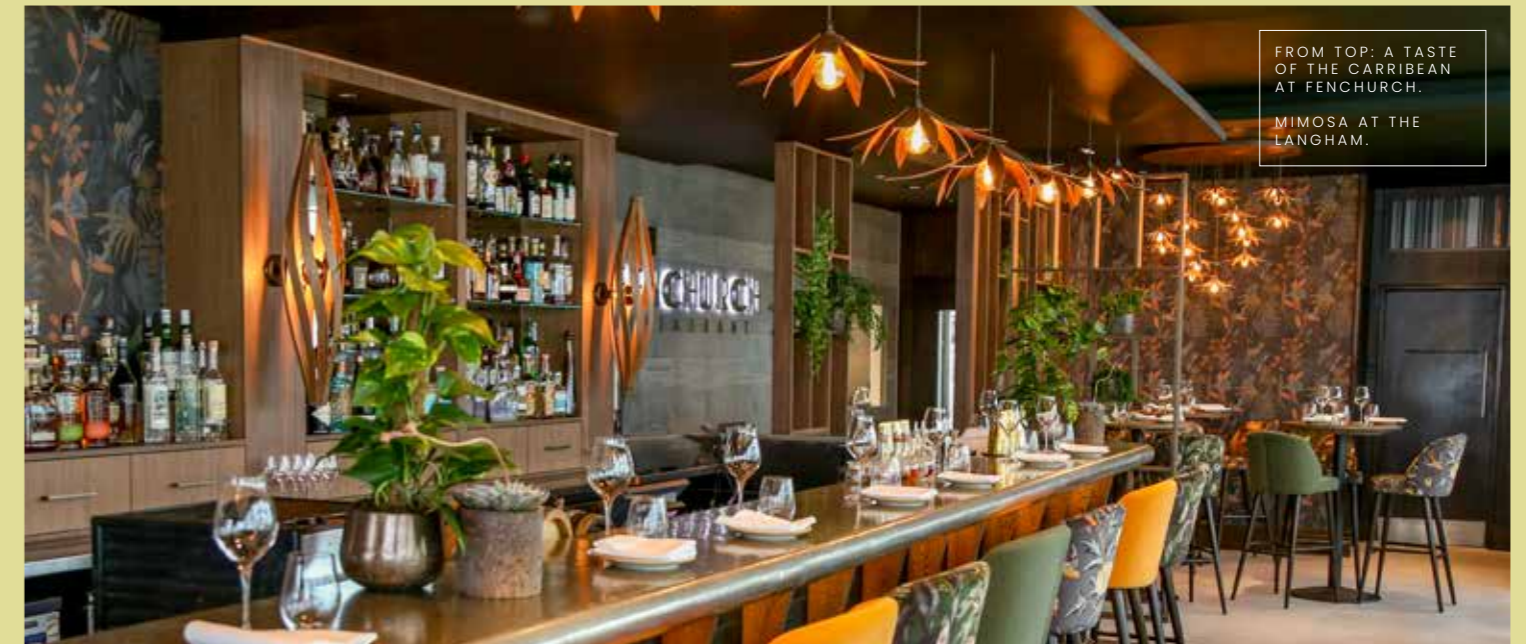
FROM TOP: A TASTE OF THE CARIBBEAN AT FENCHURCH. MIMOSA AT THE LANGHAM.