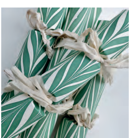
OFF WITH A BANG Nancy & Betty Studio has some sustainable crackers on the menu, filled with plastic-free winnings (left). Petra & Co's marbled green crackers are also handmade, eco-friendly options (above)

the Christmas table," agrees Abbeygate Lighting, which has a showroom in Bury St Edmunds. "Dim the lights for more of an atmospheric mood and light candles to add to the effect. You can also add a few small, touch-operated table lamps along the length of the table for a sophisticated, restaurant-style finish. Here at Abbeygate Lighting, we have a large selection of lighting solutions to create just the right festive feeling."