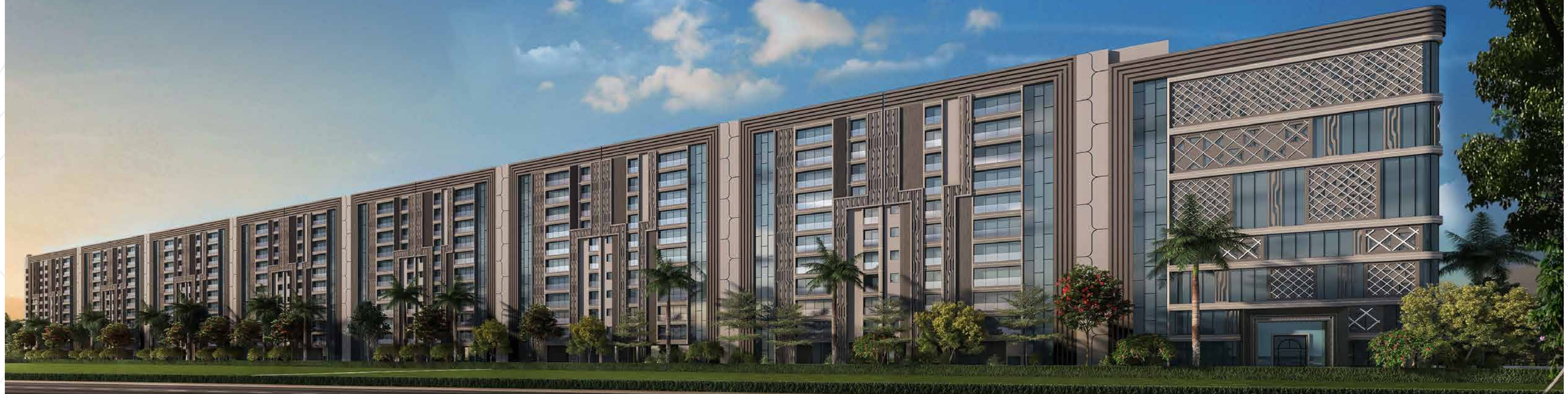
ROAD SIDE - NIGHT VIEW