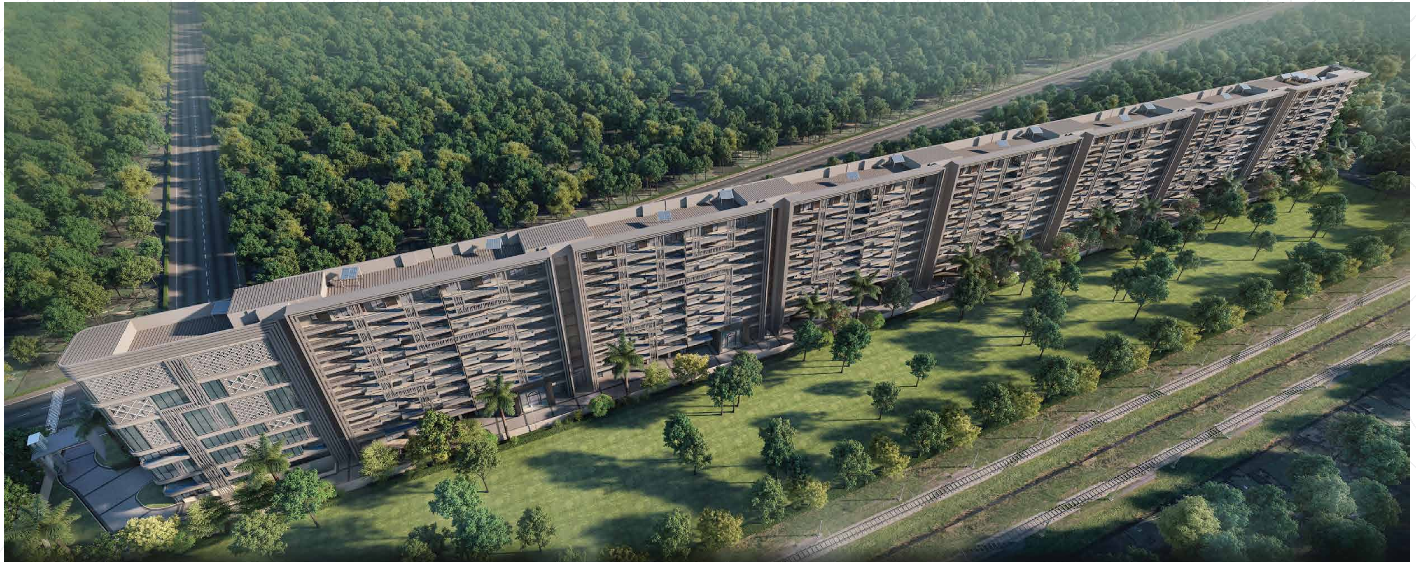
ROAD SIDE — AERIAL VIEW