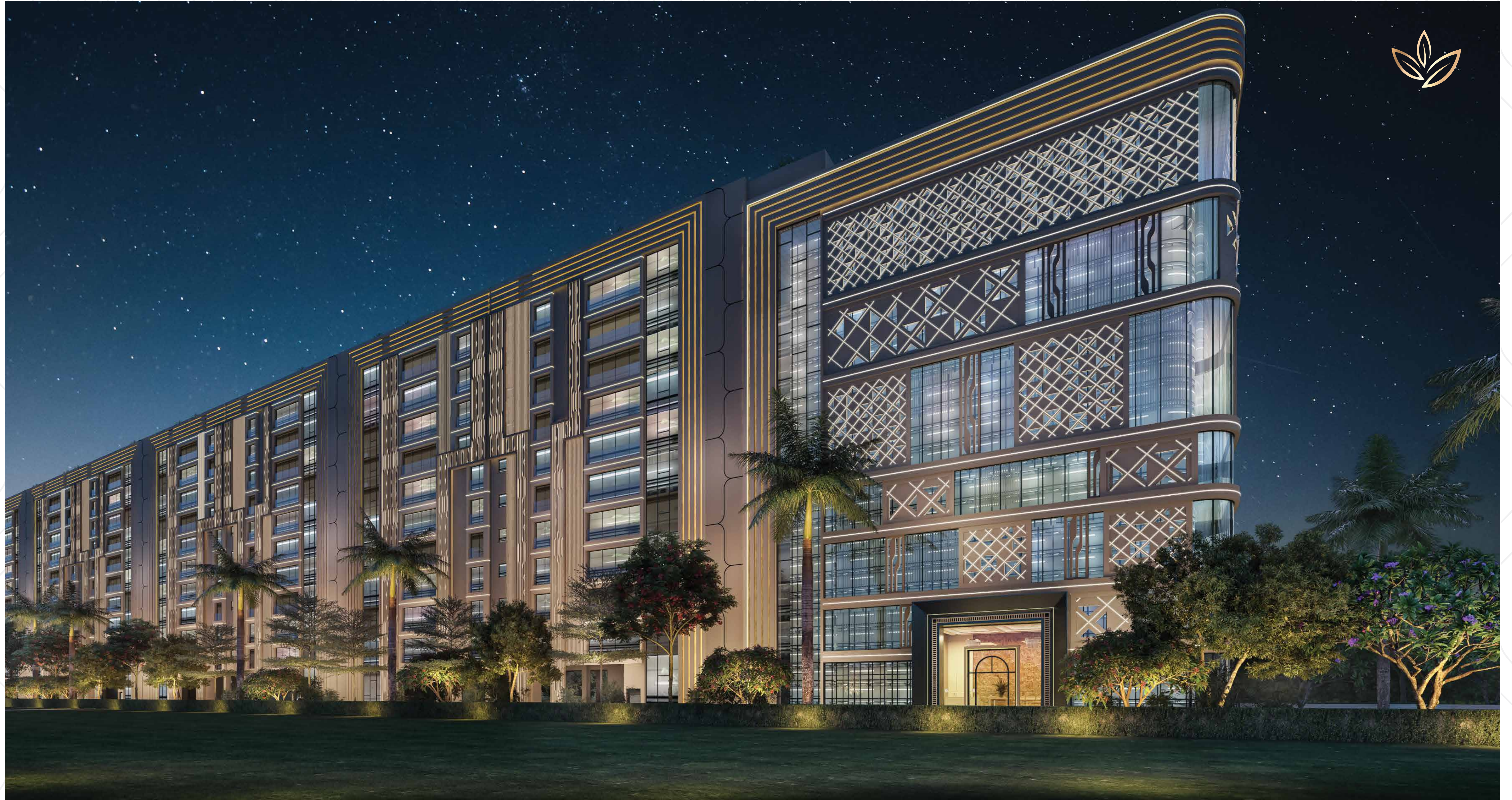
ROAD SIDE - NIGHT VIEW