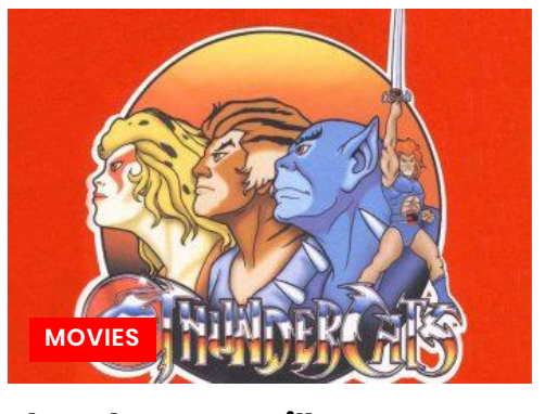
ThunderCats: Will We Ever Get a Movie of the '80s Animated Series?