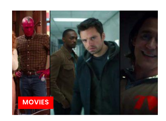
Watch: Super Bowl 2020 Movie Trailers and Ads