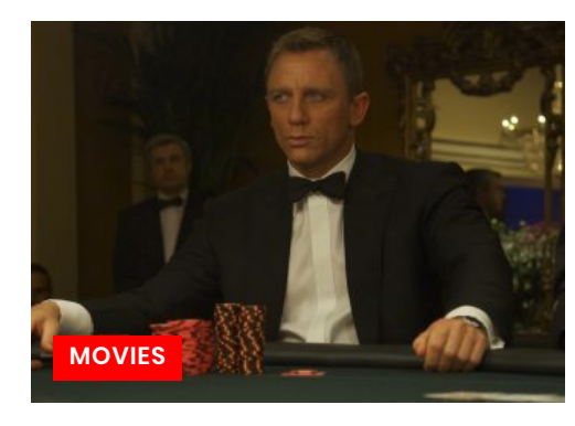
5 Most Prominent Gamblers in TV and Film