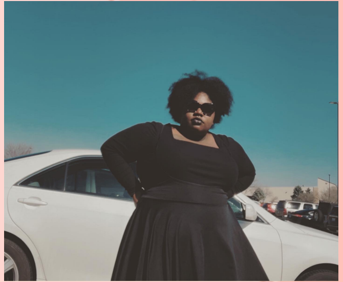
Soaking up the sun