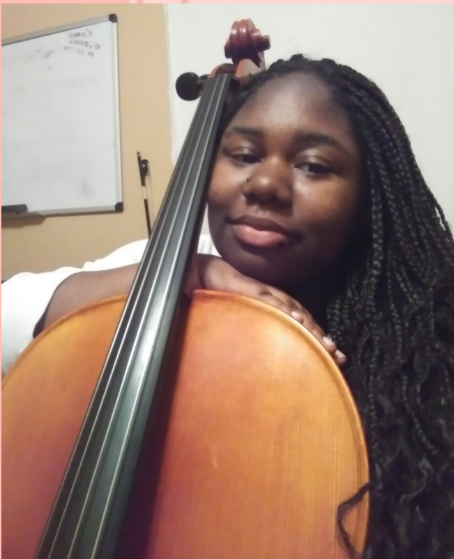
Selfie during Practice of my Cello

It all started when I was born in Littlerock, Arkansas. I did not stay there long because my mother thought the education system there was something that she did not want her children to be in. My elementary school thought I should skip a few grades, but it did not last long. I was a stubborn little 7-year-old being bullied in a 5th grade class for being the smallest one. I could not take any more ridicule, so my mom packed our bags to Dallas.