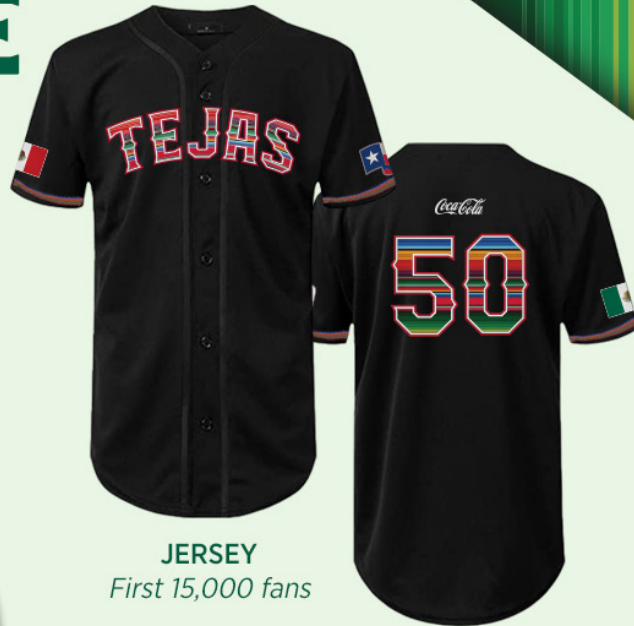
JERSEY First 15,000 fans