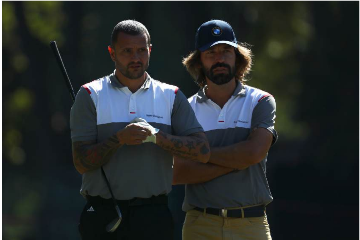
Simone Pepe (l) and Andrea Pirlo shared a uniform as members of the Italian national football team, and they did the same during the pro-am in Rome.