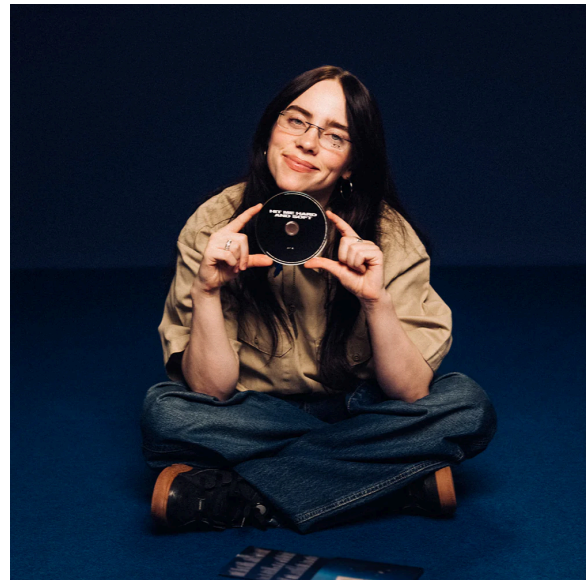
Billie pictured with the CD of her HIT ME HARD AND SOFT album.

concluding her 10-track album, she then transitions us to a letter to a past relationship, understanding that he/she is only the result of their parents, until she debunks that mindset and brings the lens back to her. Emphasizing that there is no excuse for such behavior. The strings bring us right back to the first track and conclude our experience of life through Billie’s project.