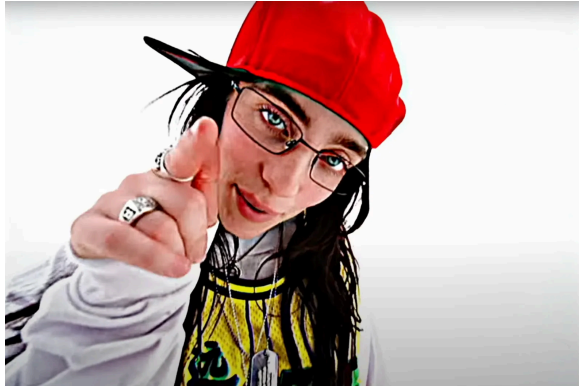
Billie Eilish in LUNCH music video: Released on May 17, 2024

“CHIIRO” is a direct reference to Spirited Away , a coming-of-age anime story that displays how a young girl becomes aware of the obstacles that life will force her to endure as change presents itself through her maturing. The song begins with a lively and vibrant beat with lyrics that describe a change entering her life and stripping her love away. As the song progresses, we reach a buildup that beautifully embraces her frustration and desperation towards this change; rejecting her ability to adapt. We transition back to the initial question with despair until we hear “And that’s when you found me.” A smooth interlude into the second half of the song that instantly switches the mood and direction, introducing us to this change with more curiosity and openness. The buildup finds its way back to conclude the track. However, we now listen with more hope and desire.