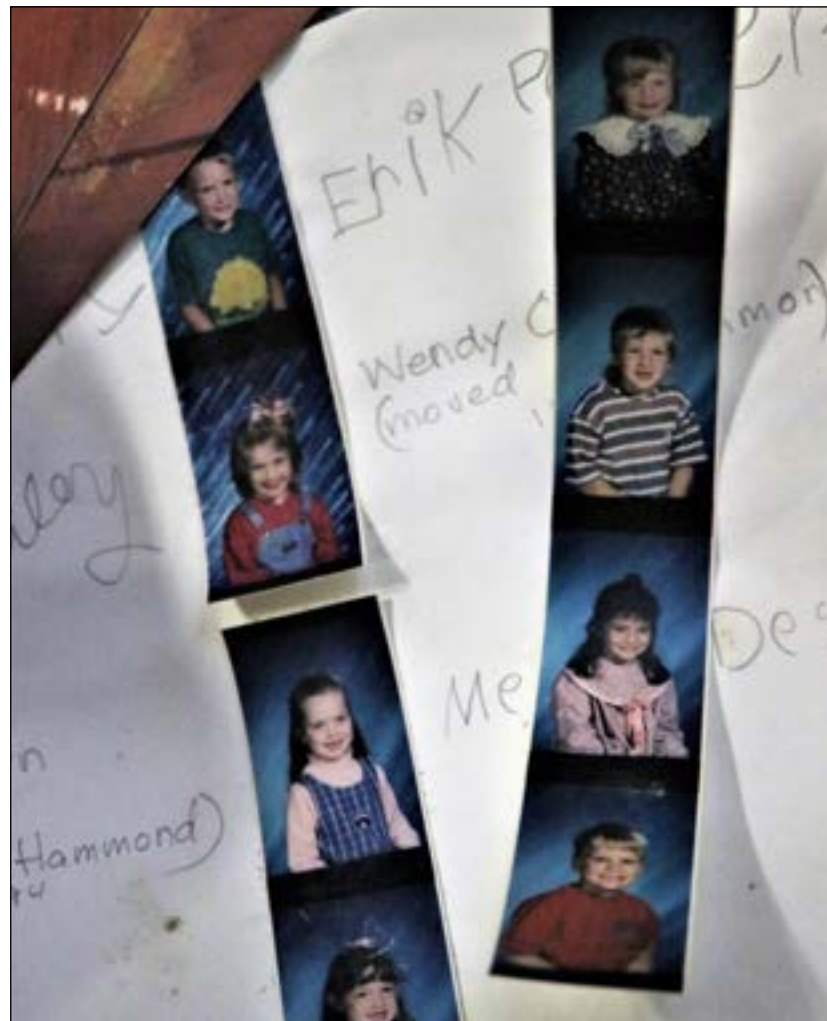
Photos from the time capsule.