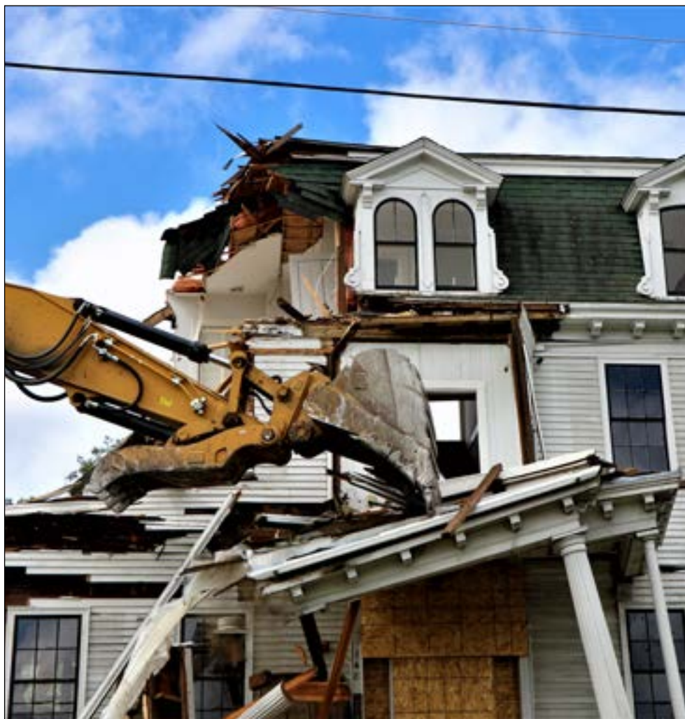
The Tobey Homestead was demolished on Monday and Tuesday to make way for an expanded emergency room.