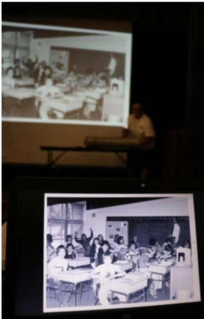
A photo from the capsule projected for all to see.