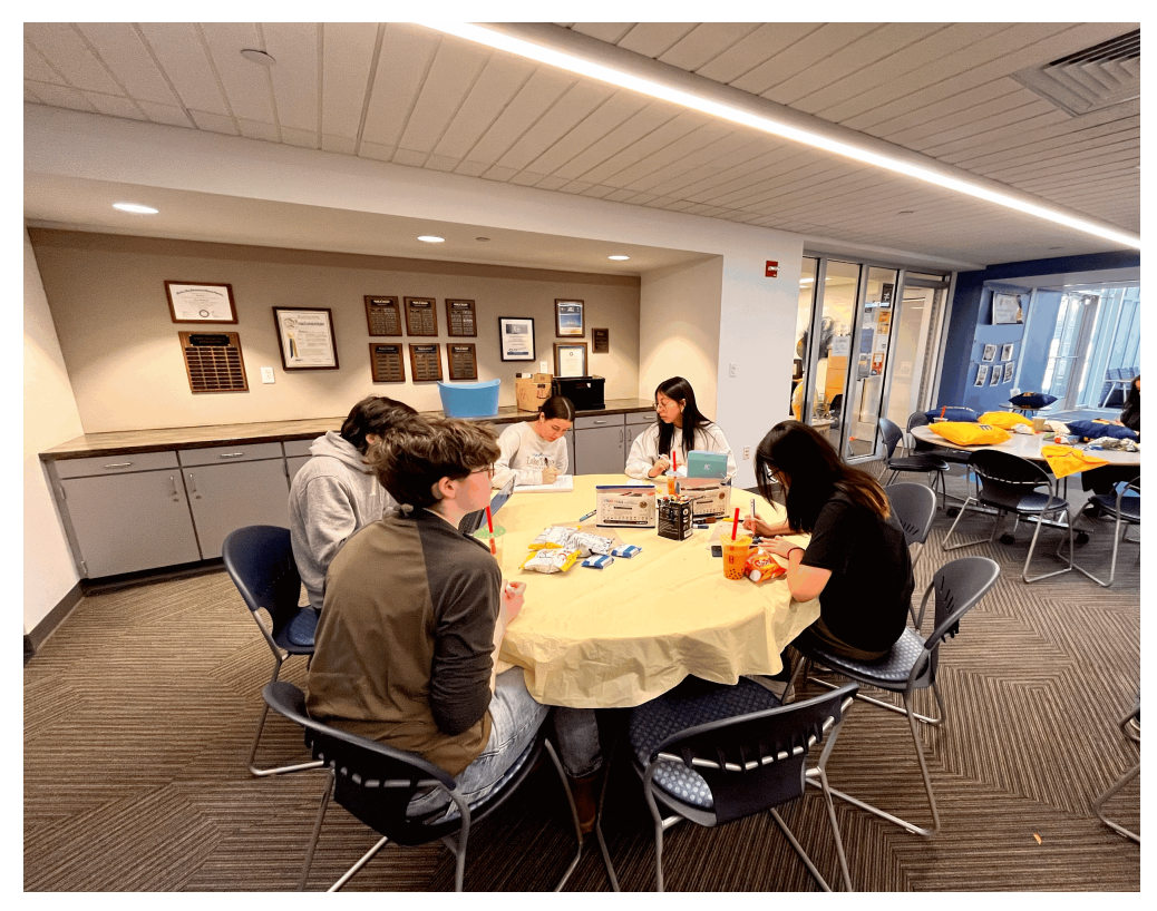
Students of Pace University gather together to paint rocks located in Kessel Student Center Main Lobby on Wednesday, March 12, 2025