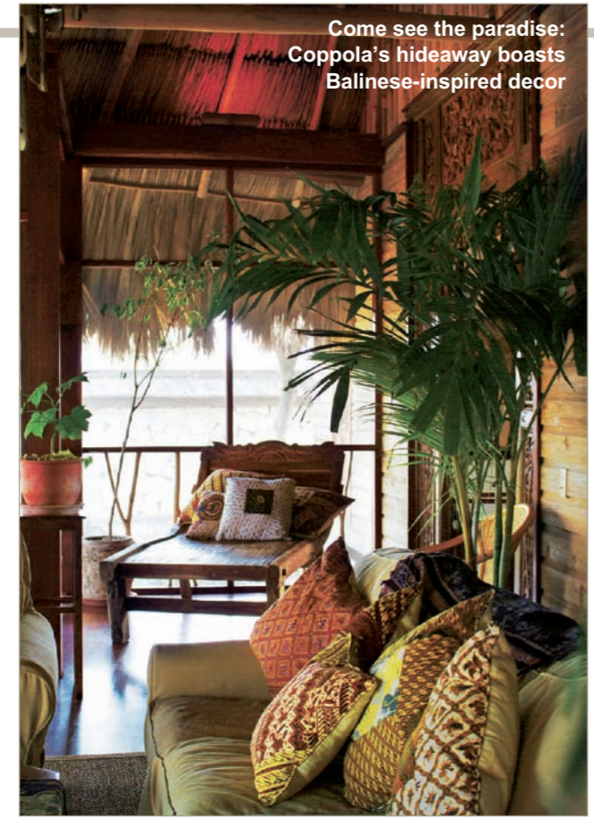
Come see the paradise: Coppola's hideaway boasts Balinese-inspired décor

Beach bicycles and sea kayaks are available, as are excursions that include a wildlife-spotting trip to the nearby Monkey River. If you like what you see on the river, you can book into Blancaneaux, a jungle retreat