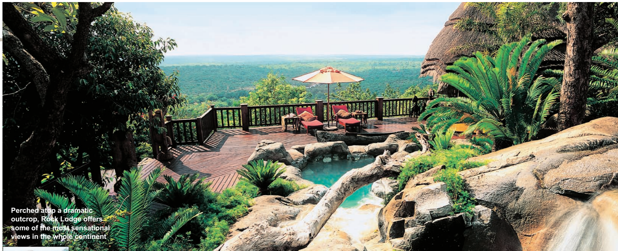
Perched atop a dramatic outcrop, Rock Lodge offers some of the most sensational views in the whole continent