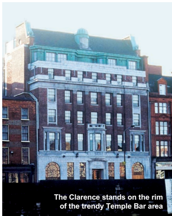
The Clarence stands on the rim of the trendy Temple Bar area

The Octagon bar has been a favourite place for Dubliners to meet for more than a century – and is where Robbie Williams and a group of friends once saw in the New Year. For somewhere quieter to start or end the evening, try the hotel's guests-only bar, The Study.