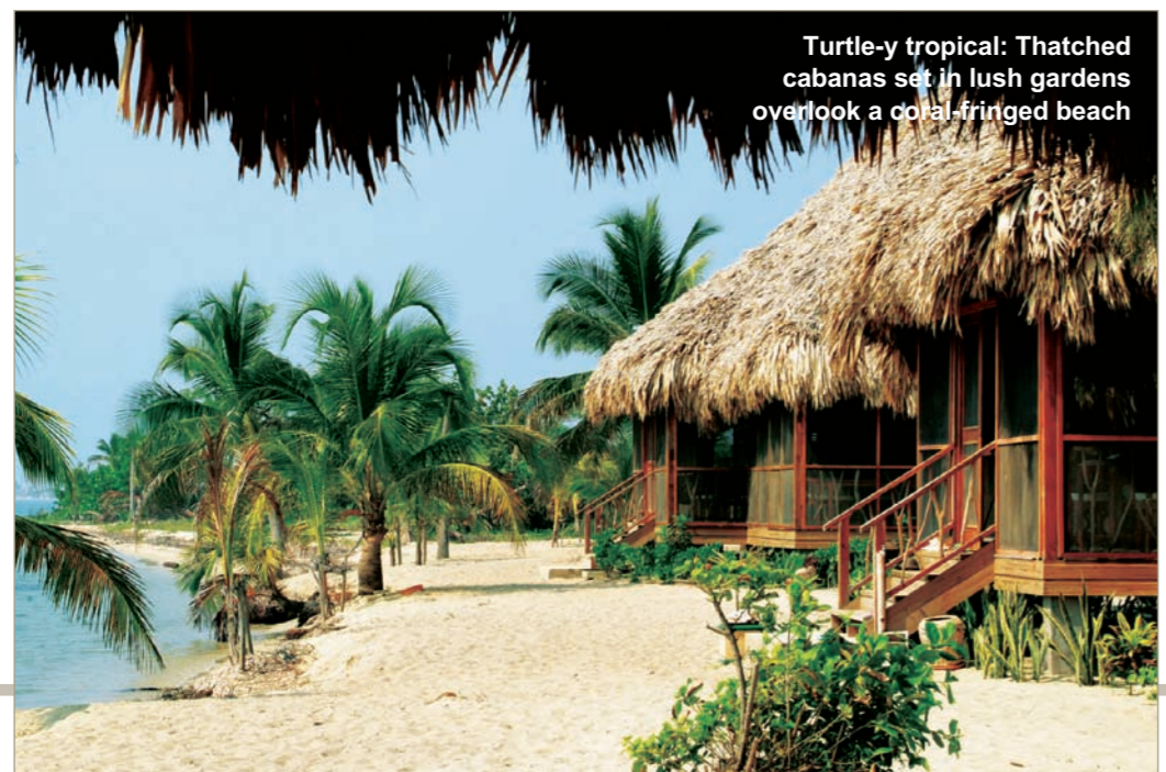
Turtle-y tropical: Thatched cabanas set in lush gardens overlook a coral-fringed beach

surrounded by rainforest, waterfalls and Mayan ruins, whose star guests have included screen siren Cameron Diaz.