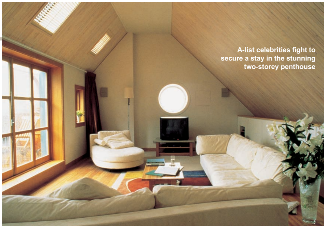
A-list celebrities fight to secure a stay in the stunning two-storey penthouse