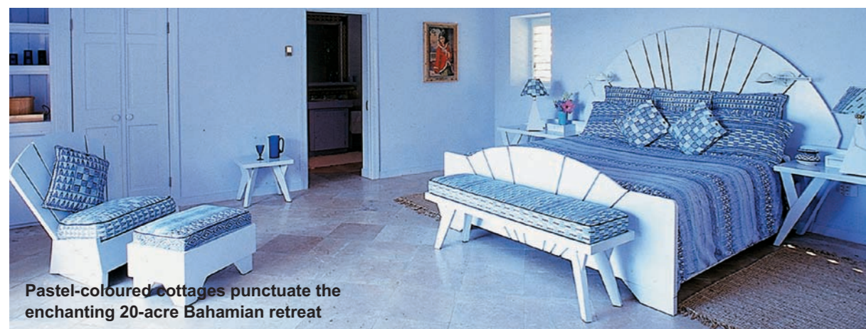
Pastel-coloured cottages punctuate the enchanting 20-acre Bahamian retreat