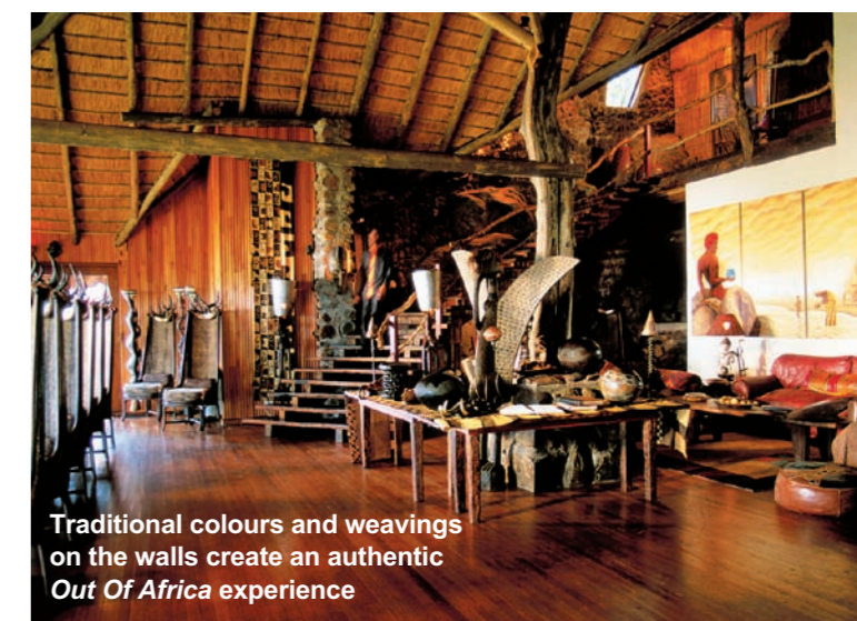
Traditional colours and weavings on the walls create an authentic Out Of Africa experience

For the ultimate in romance, the staff at Ulusaba can even organise your wedding.