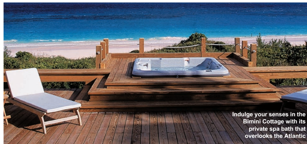
Indulge your senses in the Bimini Cottage with its private spa bath that overlooks the Atlantic

This 20-acre beachside estate is the creation of Barbara Hulanicki, who founded designer brand Biba, and has been restored by Blackwell to comprise 25 pastel-coloured cottages. Guests can opt for a one- or two-bedroom cabana in lush tropical gardens,