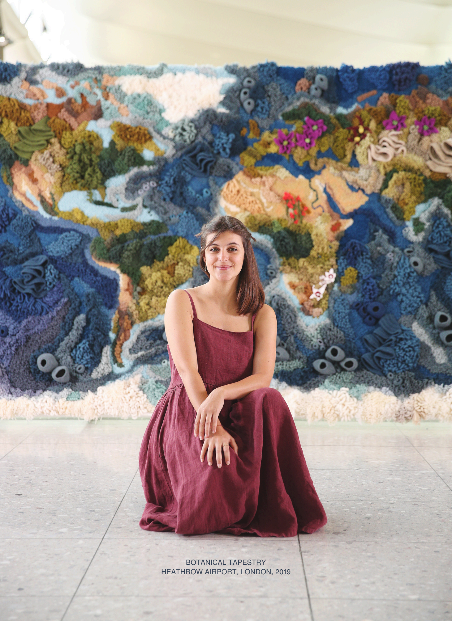
BOTANICAL TAPESTRY HEATHROW AIRPORT, LONDON, 2019