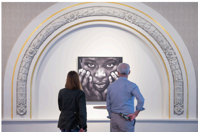
MEZZANINE LEVEL OF THE NATIONAL MUSEUM OF WOMEN IN THE ARTS; PHOTO BY JOY ASICO-SMITH