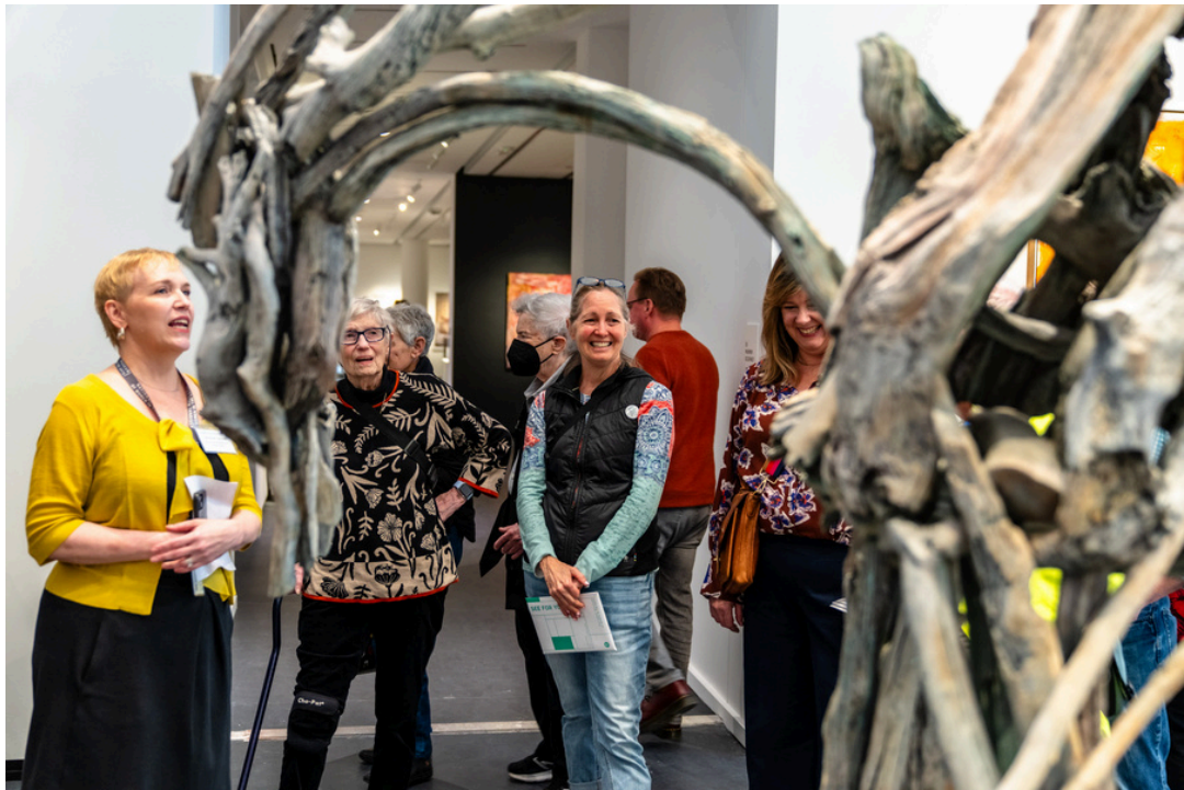
MEMBERS ATTEND A TOUR OF THE COLLECTION GALLERIES AT THE NATIONAL MUSEUM OF WOMEN IN THE ARTS, OCTOBER 20, 2023; PHOTO BY ELYSE COSGROVE/ASICO PHOTO