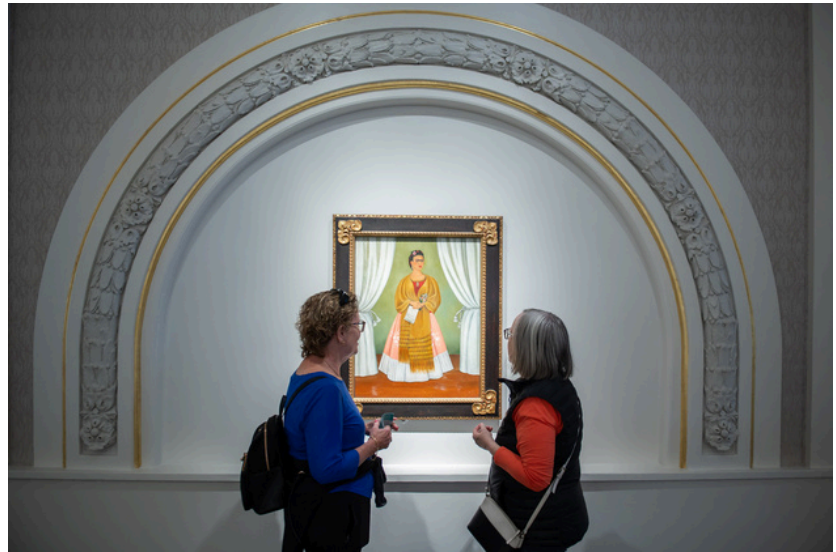
MEZZANINE LEVEL OF THE NATIONAL MUSEUM OF WOMEN IN THE ARTS

Governments and institutions have performed tremendous roles in perpetuating gender inequality inside the arts. Historically, regulations and practices have excluded girls from formal art training and professional guilds, which are vital for artistic development and recognition. The loss of institutional help has pressured many women to pursue their artistic careers without the identical sources and opportunities available to their male opposite numbers.