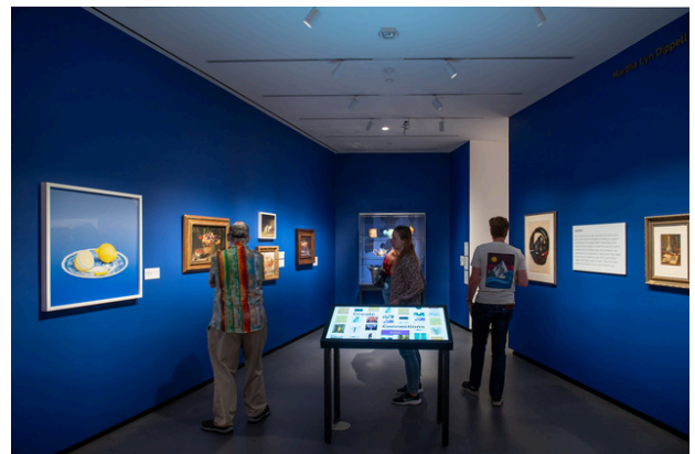
COLLECTION GALLERIES AT THE NATIONAL MUSEUM OF WOMEN IN THE ARTS