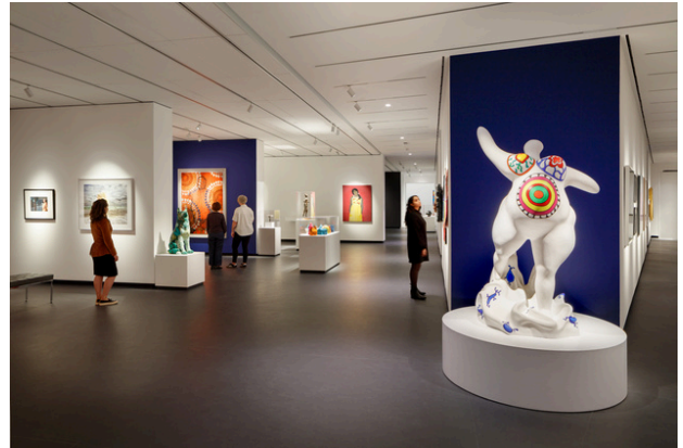
COLLECTION GALLERIES AT THE NATIONAL MUSEUM OF WOMEN IN THE ARTS

The past due nineteenth and early 20th centuries noticed male dominance inside the art world grow to be extra suggested. However, the 20th century began to shift these inclinations. From the mid-twentieth century onwards, girls started out gambling major roles in diverse movements, along with Modernism, Abstract Expressionism, and Feminist Art. Artists such as Frida Kahlo, Lee Krasner, and Judy Chicago did an awful lot extra than make contributions to those movements; additionally they shifted antique gender norms and brought women's troubles to the foreground.