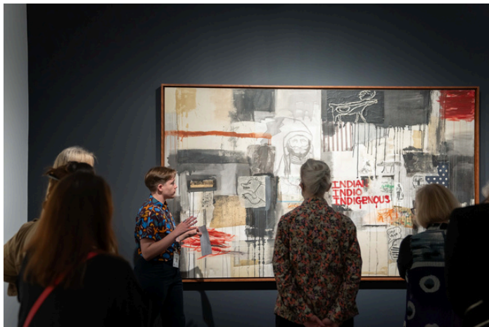
MEMBER PREVIEW DAY AT THE NATIONAL MUSEUM OF WOMEN IN THE ARTS, OCTOBER 20, 2023