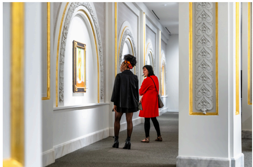
MEMBER PREVIEW DAY AT THE NATIONAL MUSEUM OF WOMEN IN THE ARTS, OCTOBER 20, 2023; PHOTO BY ELYSE COSGROVE/ASICO PHOTO