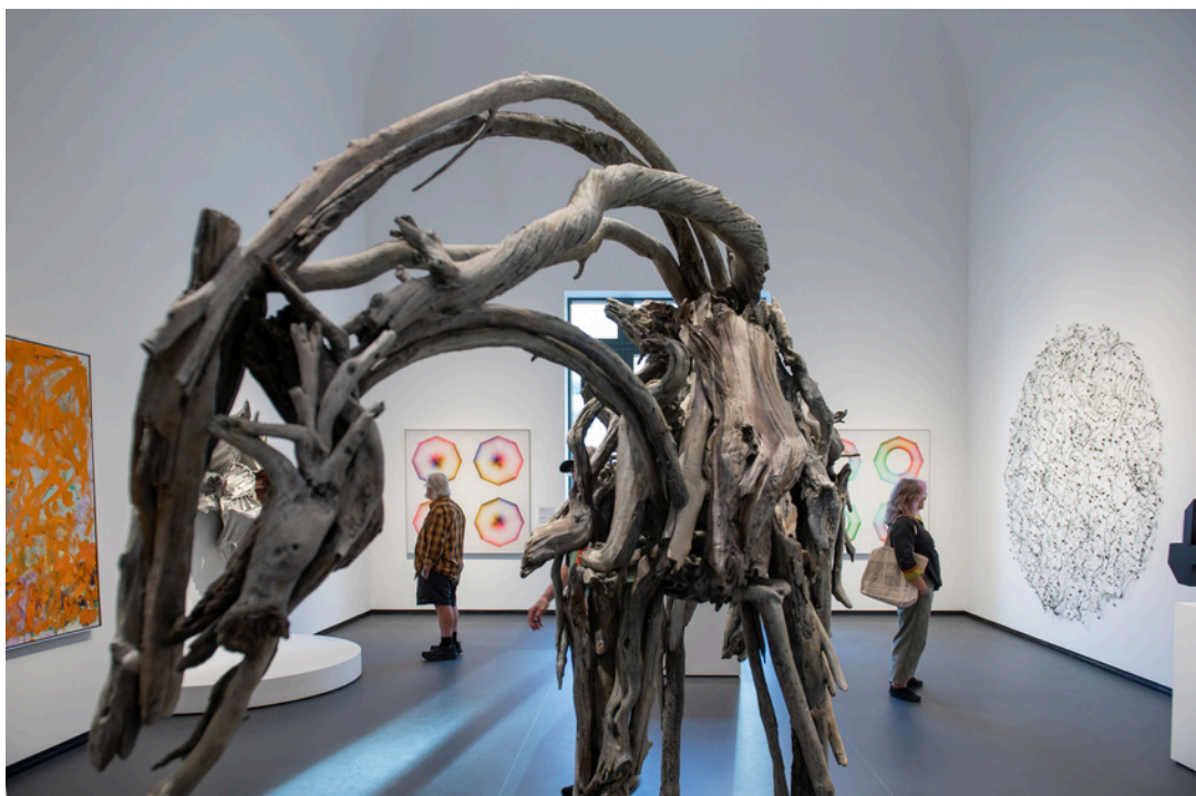
COLLECTION GALLERIES AT THE NATIONAL MUSEUM OF WOMEN IN THE ARTS