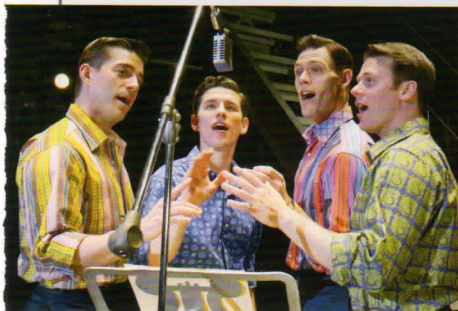
Top Left: Thanks to smooth operations backstage, you can't even tell that The Four Seasons have only 30 seconds to change costumes in time for "Sherry".