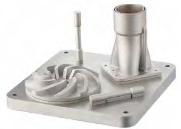
Additive manufactured parts with specimens for mechanical testing on a build plate are shown here.

If simulation reveals a strain, the designers use this data to identify points in the geometry where a change in the structure will help mitigate the