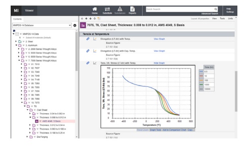
Figure 4. Browsing the aerospace handbook data.