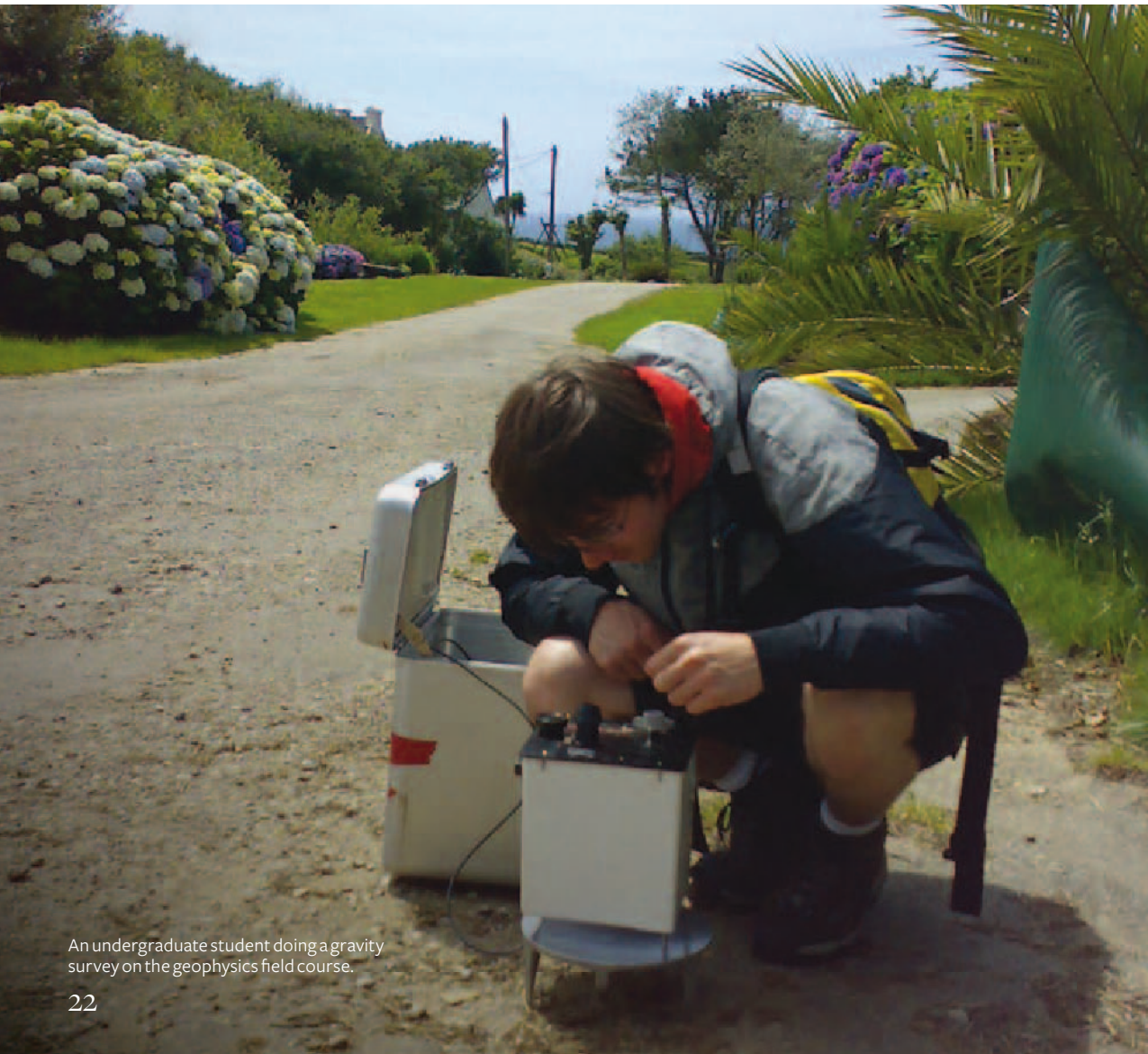
An undergraduate student doing a gravity survey on the geophysics field course.

For further course and module information please visit www.southampton.ac.uk/oes/undergraduate/index.page