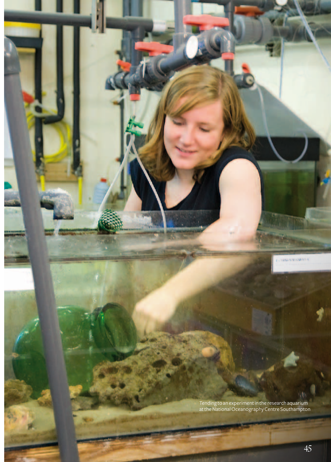
Tending to an experiment in the research aquarium at the National Oceanography Centre Southampton

Further information and a full list prizes and scholarships can be found at: www.southampton.ac.uk/oes/undergraduate/fees_and_funding.page