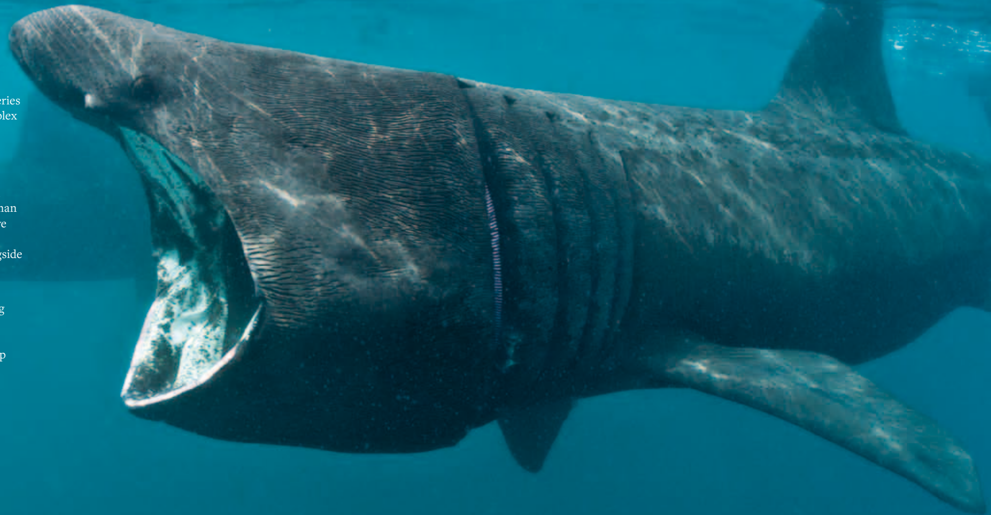
A basking shark

Our marine biology degree pathways will develop your understanding in a progressive fashion, adding knowledge and practical skills over time so that by graduation you will have a suite of biological and oceanographic skills which will allow you to develop your career wherever in the world you wish to live.