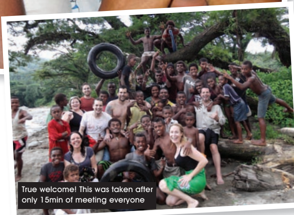
True welcome! This was taken after only 15min of meeting everyone

I am forever grateful to the village of Matainasau, for the natives