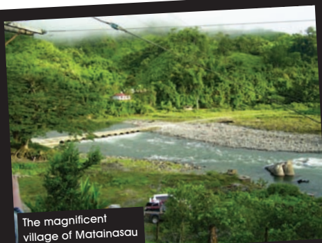
The magnificent village of Matainasau

"They showed me their polish removal system; it was simple, by using a butter knife or blade they scraped the polish off the nail plate."