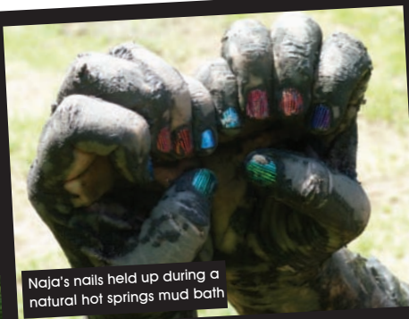
Naja's nails held up during a natural hot springs mud bath