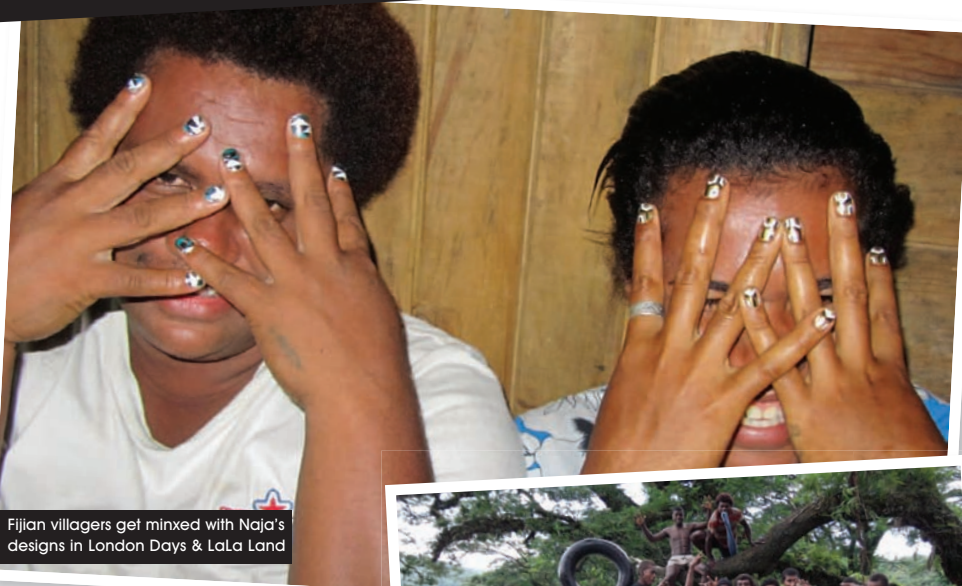
Fijian villagers get minxed with Naja's designs in London Days & LaLa Land

The women of the village cooked elaborate meals for 10 extra people a day, while the men of the village made bamboo rafts and carried us (me) less strong swimmers across their heavy current river. I joined the women in the kitchen and offered to do their nails. I'd brought my custom collection of Minx designs and used the fire from the store as my heat source. Once applied they were wowed and honoured to have their metallic nails. I even cut out the 'Naja' on the minx sheet and Minxed up some of the men in the village with my name. They were so joyous and all the women were intrigued. They told me, "This is Fiji,"