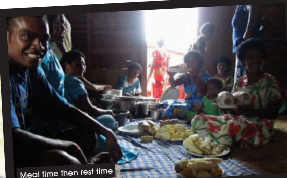
Meal time then rest time