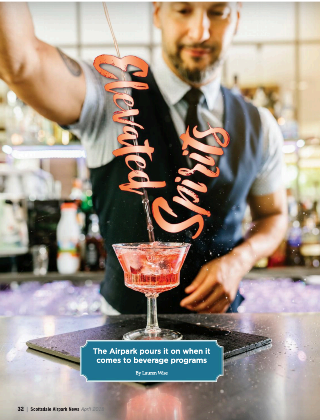
The Airpark pours it on when it comes to beverage programs By Lauren Wise