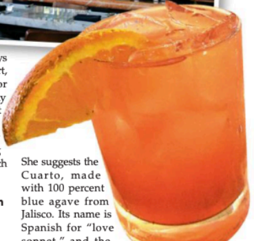
Tequila-infused cocktails: Mission accomplished at The Mission Kierland.