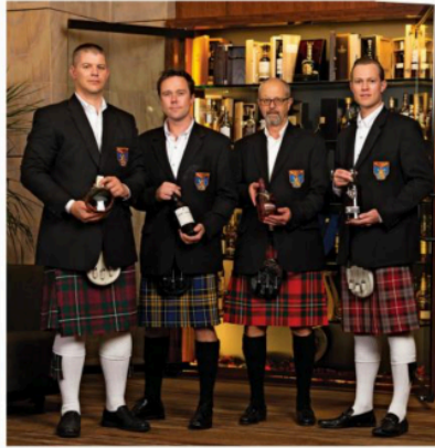
Scotch ambassadors school visitors in the ways of whisky at Westin Kierland.

"What makes our collection unique is our