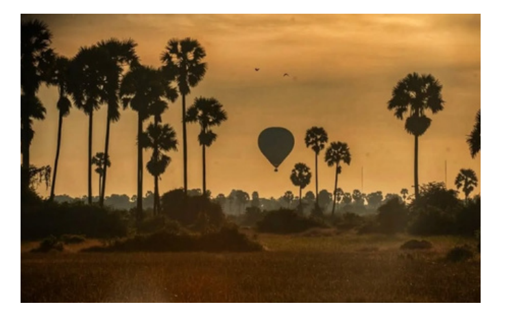
3. Take a <u>hot air balloon ride</u> over the ancient city of wonders