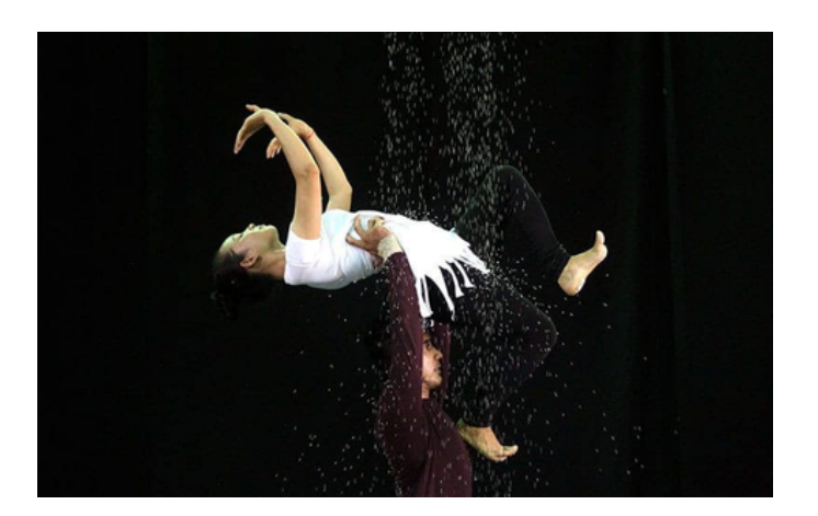
5. Enjoy a one-of-a-kind cultural performance at the <u>Phare Circus</u>