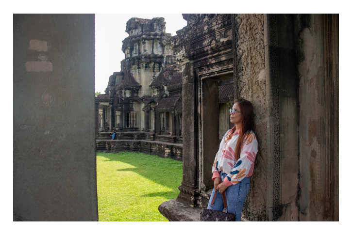
1. Visit the iconic <u>Angkor Wat temple</u> <u>complex</u>