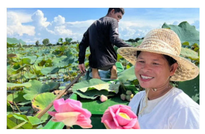
4. Take a serene boat ride through picturesque <u>lotus fields</u>