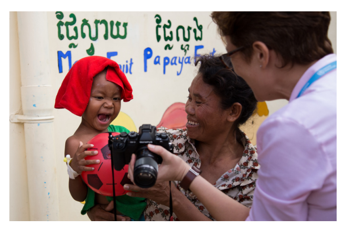
6. See your impact firsthand with an exclusive tour of AHC