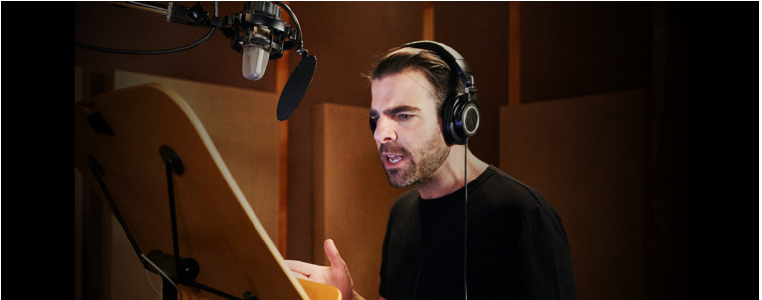
A creative two-for: Zachary Quinto performs an Audible Original sci-fi thriller, "The Dispatcher", written by bestselling author John Scalzi.