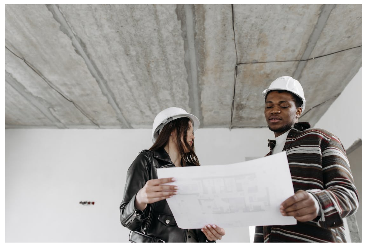
Architect as a companion in buildings home

Why are architects the best companions in building your dream home?