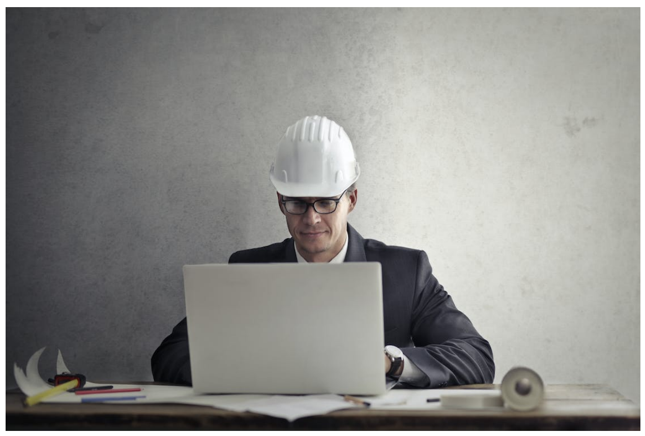
Architects making a design

Who are the most popular architects in the Philippines?