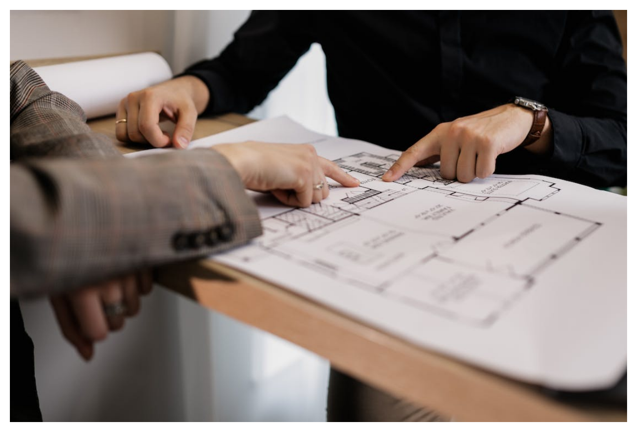
Architect I Photo from Pexels

Behind every great design and structure—is an architect's hard work and ideas. As you admire the <u>exquisite architectural structures</u> of countries like Germany, Italy, Spain, China, and Japan, it is essential not to disregard the invaluable contributions of the finest Filipino architects. They have made an indelible mark on the field, deserving recognition alongside their international counterparts.