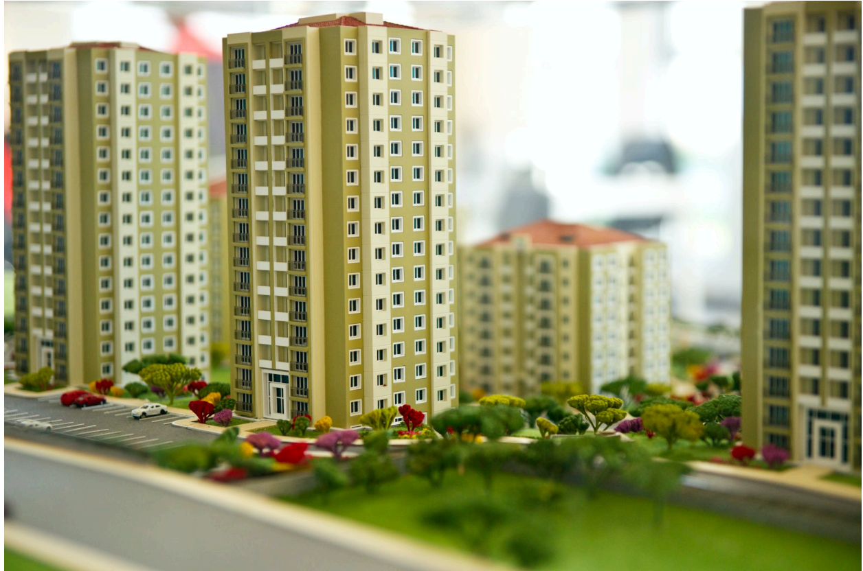
Ideal studio apartment

Due to the rising real estate demand in the Philippines, there is a growing need for attractive and luxurious properties like the condominium for sale in Bern Baguio. For investors who want to save space with a full advantage, a small studio apartment with a living room, bedroom area, dining area, and ample natural light presents a perfect solution.