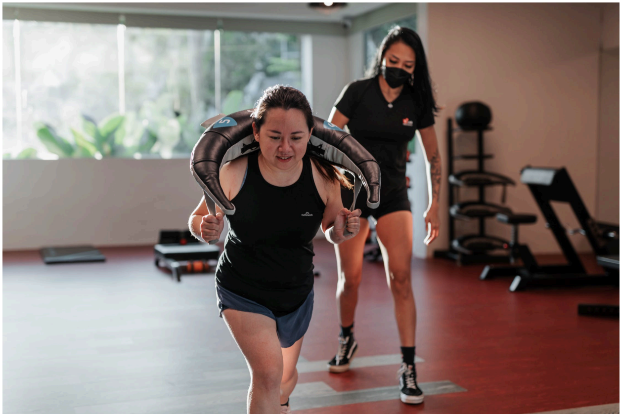
Fitness center